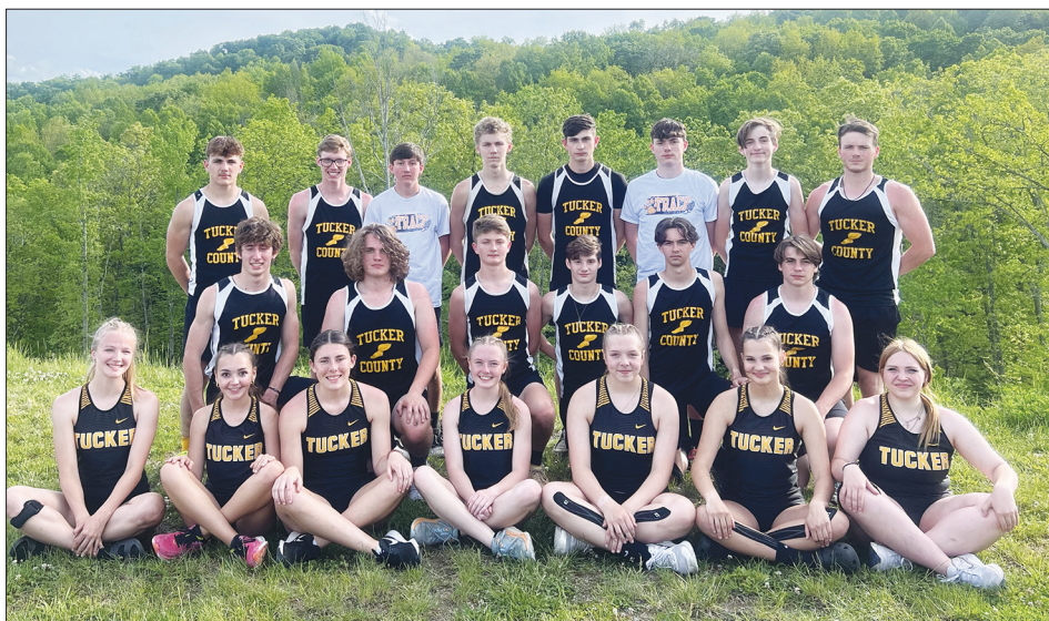
2024 Tucker County High School Track Team