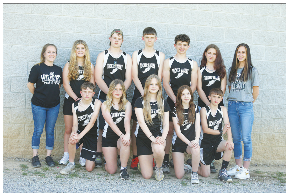
2024 Tucker Valley Middle School Track Team