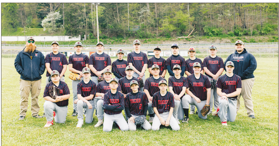
Tucker Valley Middle School Baseball Team Pic