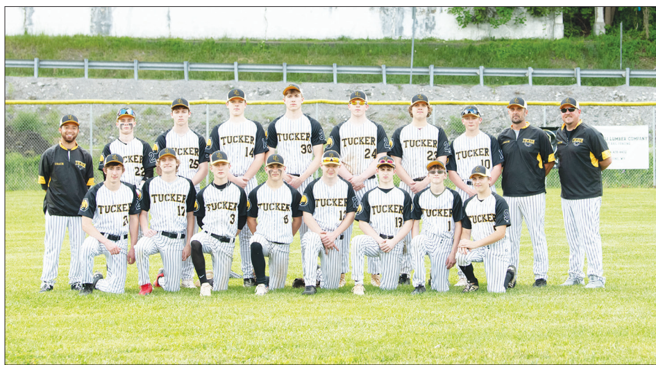
2024 Tucker County High School Baseball Team