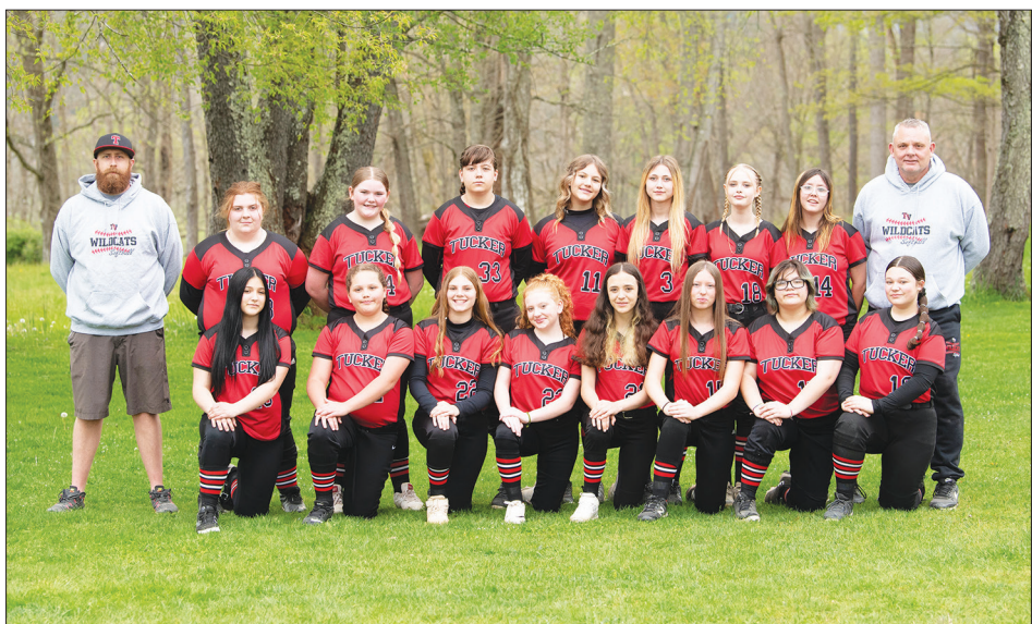
2024 Tucker Valley Middle School Softball Team