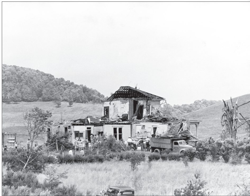
June 23, 1944: A tornado struck Shinnston and the surrounding area, killing 103 people and injuring hundreds more.

Charleston WV – The following events happened on these dates in West Virginia history. To read more, go to e-WV: The West Virginia Encyclopedia at www.wvencyclopedia.org.