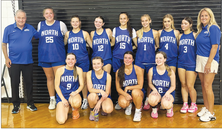
The North Girls' Basketball team after the North/South All-Star game on June 14th.