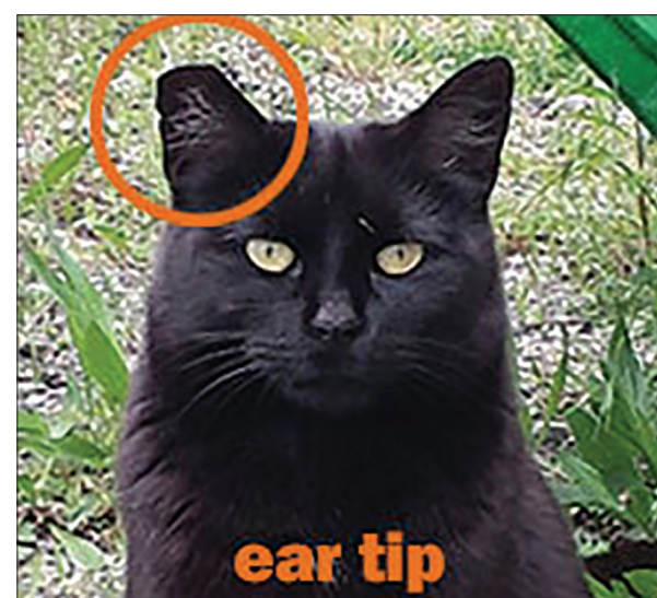
A feral cat that has one ear slightly shorter with a flat top has been ear tipped. This is done to identify that the cat has been spayed or neutered and is therefore free to roam.

Due to the lack of a veterinarian in Tucker County,