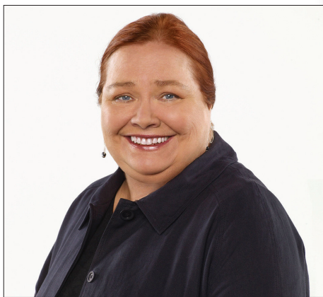
Oct. 12, 2020: Actress Conchata Ferrell died. Born in Loudendale, Kanawha County, Ferrell was best known as Berta the housekeeper on the CBS sitcom Two and a Half Men. She enjoyed a long career on stage, film and television.

The Chamber of Commerce is hosting a Meet the Candidates, Tuesday Oct. 15th from 5-7pm. Open to everyone, please bring your questions for the candidates on the November Ballot.