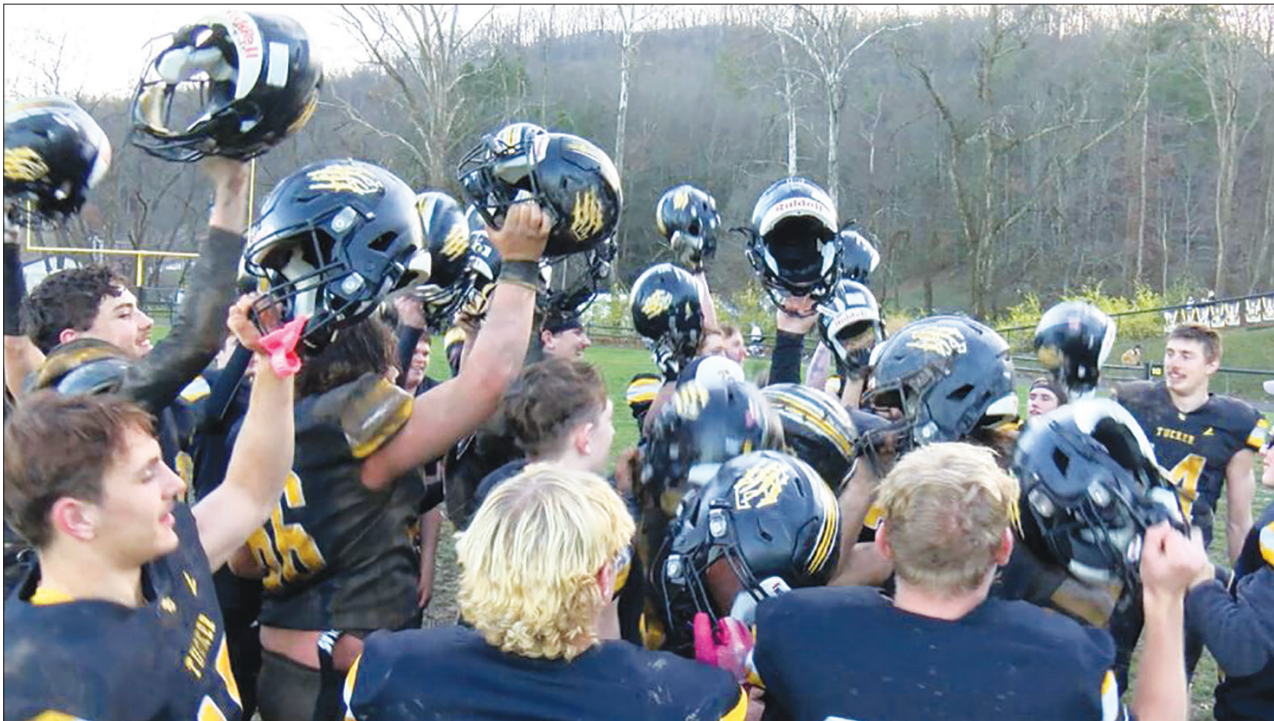
Mt. Lions celebrate the win