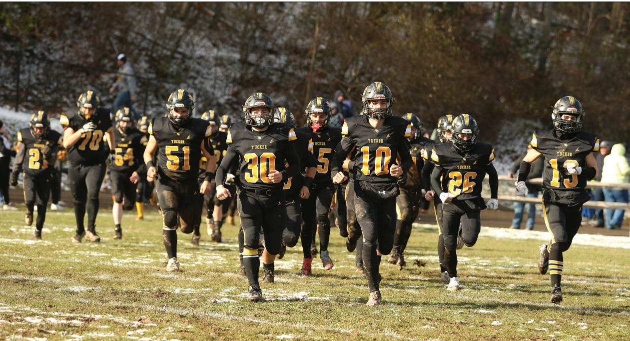
Mt. Lions head onto the field to start the quarterfinal contest.