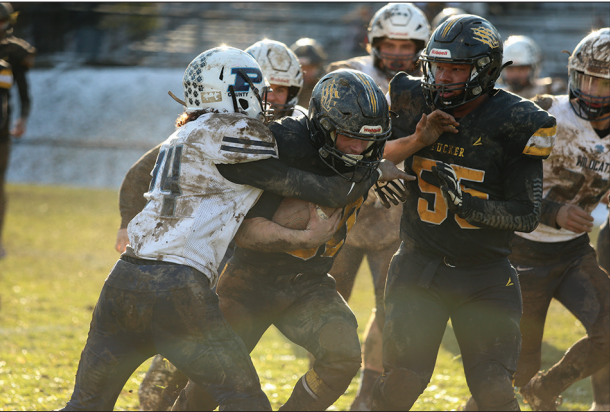
Reall pushes through.