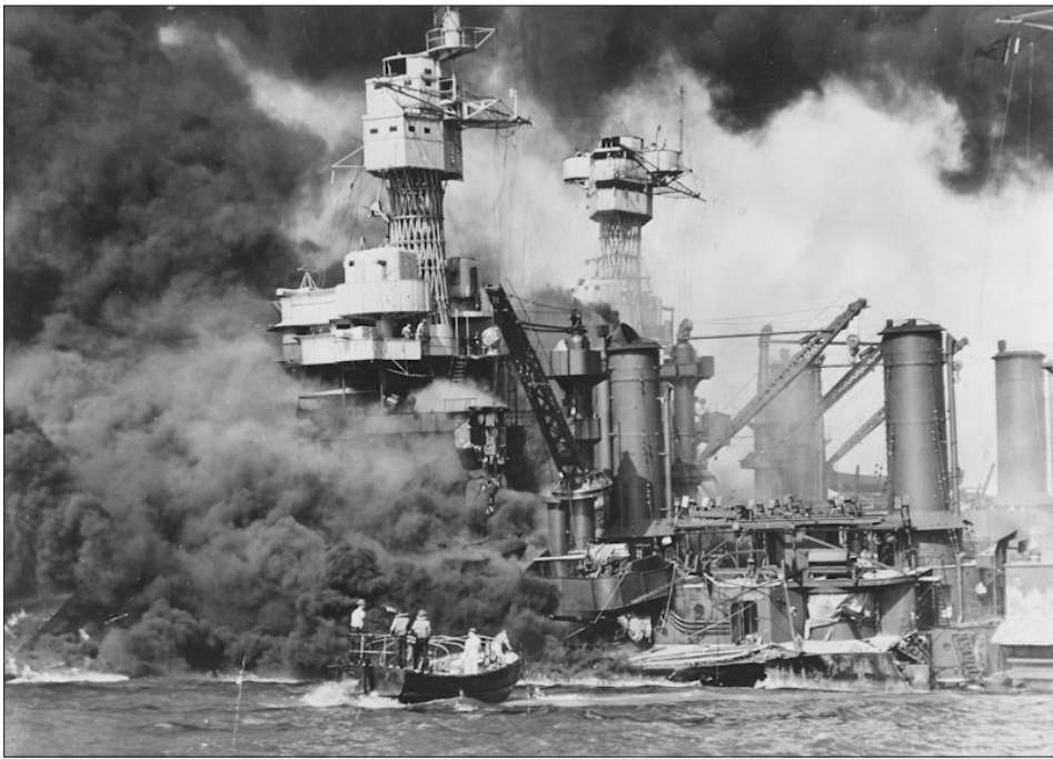
Dec. 7, 1941: The Japanese attacked Pearl Harbor. The USS West Virginia suffered massive damage from torpedoes and bombs. Two officers, including the captain and 103 crew members, died.

Charleston WV – The following events happened on these dates in West Virginia history. To read more, go to e-WV: The West Virginia Encyclopedia at www.wvencyclopedia.org .