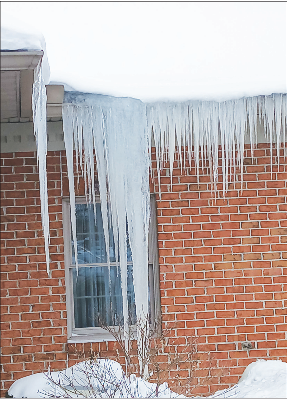
Ice on front of Mountain Valley Bank.