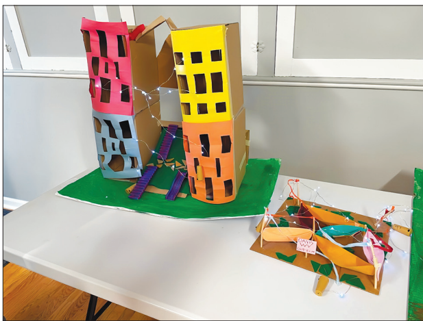
Students from Upperside Down Secondary School answered questions from the Davis Town Council May 13th.

would like to see additional foot traffic in Davis. The survey also showed that 95% of businesses would like to see more activities in the Town, as well.