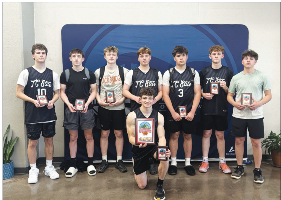
TC Elite, High School Division