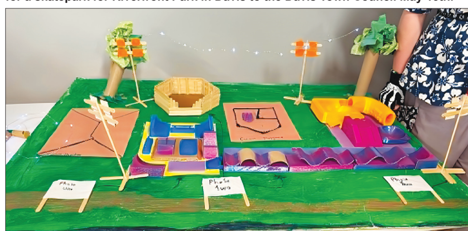
Students from Upperside Down Secondary School in Davis brought a model of their proposed "Pipe Dream Skatepark" to the Davis Town Council May 13th to accompany their presentation. The project is proposed to occur in three phases.