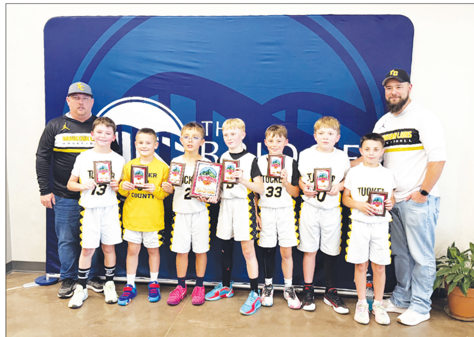
Tucker Co, Grades 3/4 Division