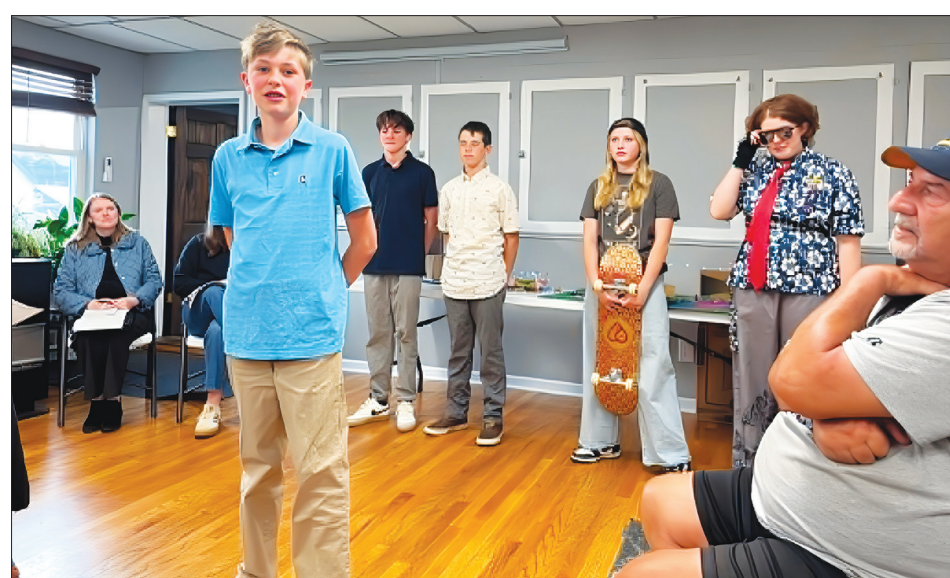
Students from Upperside Down Secondary School in Davis presented their vision for a skatepark for Riverfront Park in Davis to the Davis Town Council May 13th.