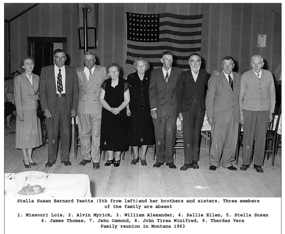
Barnard Family Reunion in Saco, Montana 1963