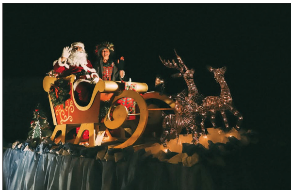
Santa Claus and Mrs. Claus will be onsite nightly during the 11-nights of the fourth annual Festival of Lights. (Photos are from the 2023 festival)