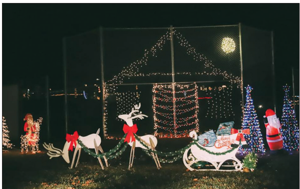
The festival will feature 58 different light displays created by local businesses, churches, organizations, families, and individuals.