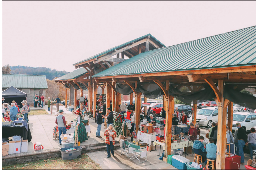
The Mistletoe Market.