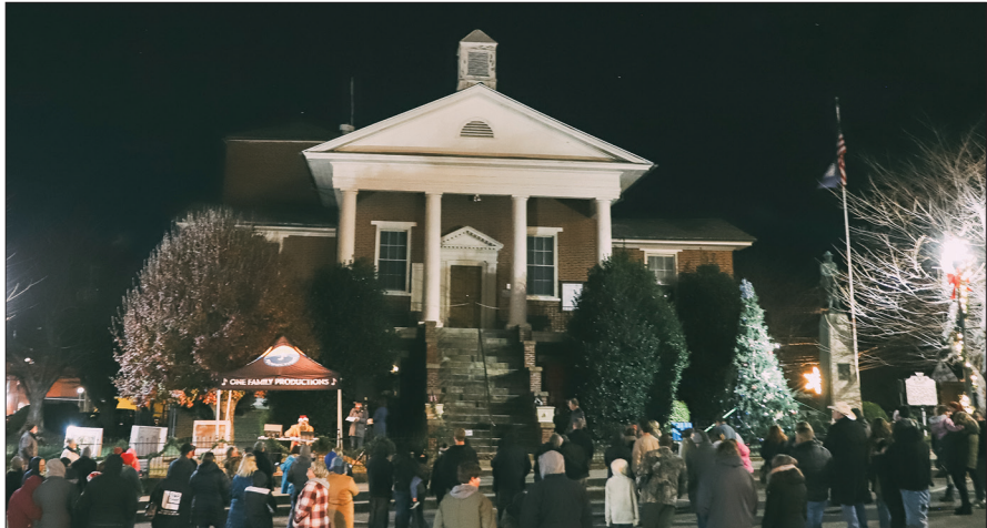
The Grand Illumination attracted a large crowd.