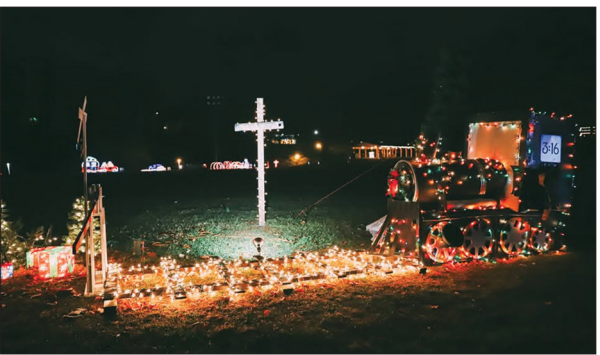
The Festival of Lights will be held Friday, December 13 through Monday December 23. It is open Sunday through Thursday from 6-8 p.m., and on Fridays and Saturdays from 6-9 p.m.