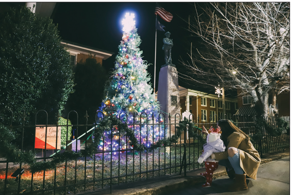
A toddler is in awe after the Grand Illumination Tree Lighting ceremony.