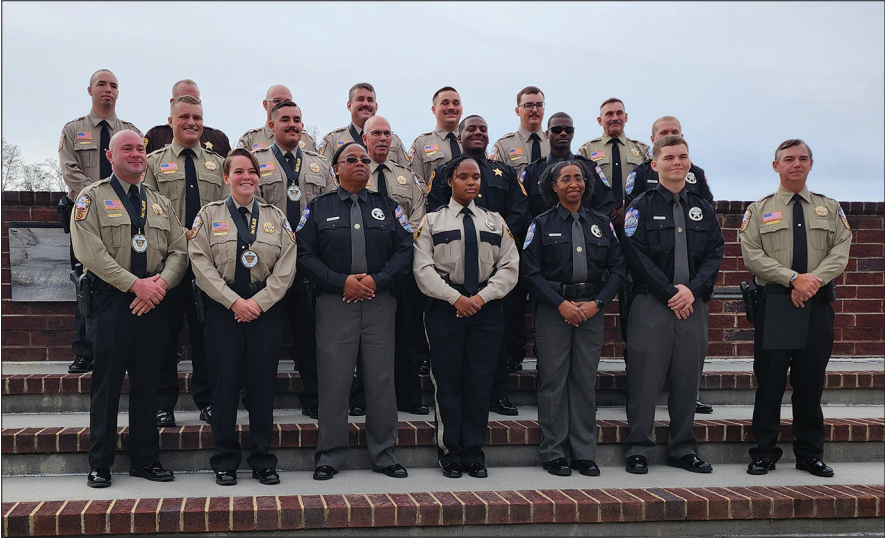
The 41st class poses for a commemorative photo following the ceremony at New College Institute.

The Piedmont Regional Criminal Justice Academy celebrated the graduation of 20 officers on November 27 as part of its 41st class. The ceremony, held at the New College Institute (NCI), marked the culmination of 11 weeks of rigorous training. Among the graduates, one officer will join the Martinsville City Sheriff's Office, while 12 will bolster the ranks at the Henry County jail. Another group of officers is set to graduate on December 12.