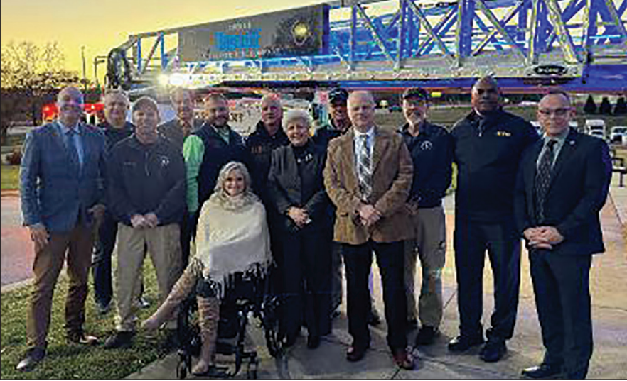
Members of the Henry County Board of Supervisors and the Bassett Volunteer Fire Department pose with the newly acquired ladder truck after the Nov. 22 meeting.

Performances of Holiday Extravaganza will take place December 4-6 at 7 p.m. and December 7 at 1 p.m. and 6 p.m. at the Walker Fine Arts Theatre. Tickets are $20 in advance at www.phccpatriotplayers.com/tickets or $25 at the door.