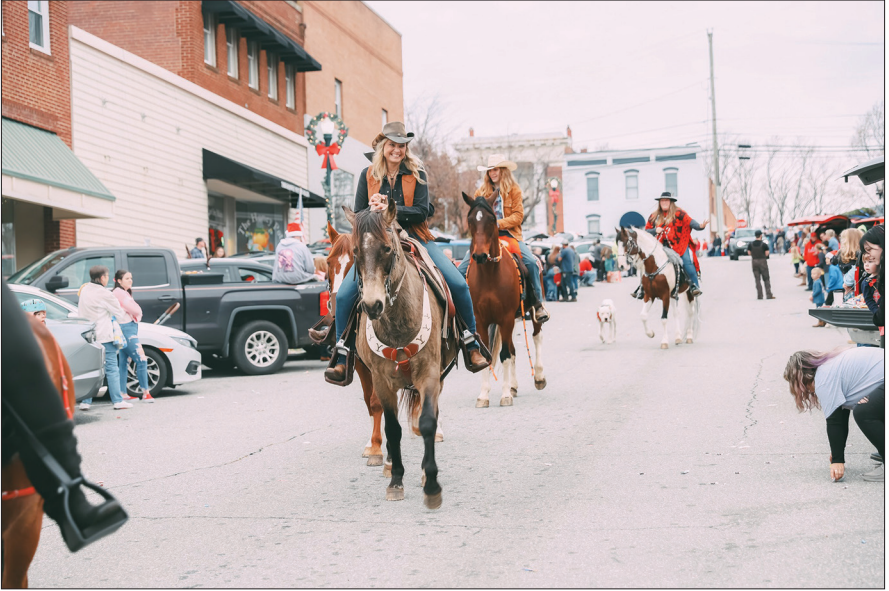
Horses and riders are always a welcome addition to the Patrick County Christmas Parade.