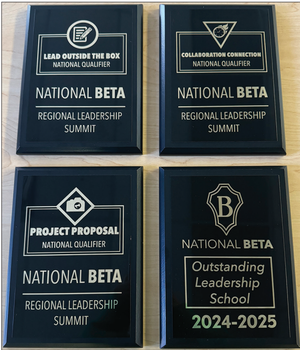
Leadership Summit VA 2024.25 Plaques

ar Treat provided for Pre-K through first-grade students. Members are fundraising, preparing for the state convention in February 2025, and practicing for competitions at the state convention. With more than 500,000 active members and 14,000 clubs nationally and internationally, National Beta has become the nation’s largest independent, non-profit, educational youth organization. National Beta promotes the ideals of academic achievement, character, service, and leadership among elementary and secondary school students. National Junior Beta includes grades 4-8 and National Senior Beta includes grades 9-12. Visit betaclub.org for more information.