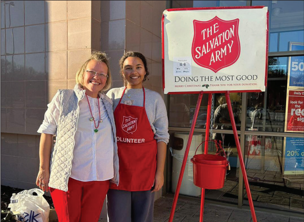
A Salvation Army bell ringer stationed outside a local retailer invites donations. (Contributed)

The evening coincides with the center's month-