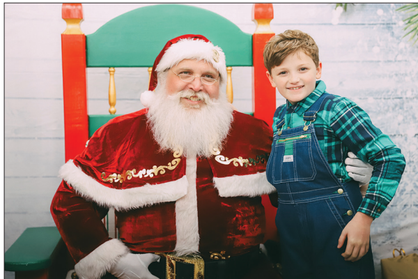
Youngsters posed with Santa, the man of the hour. He made an appearance at many of the festivities.