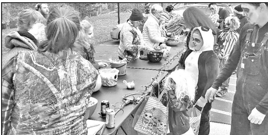
The Lighthouse Baptist Church had kids lined up to get candies and fill their bags.