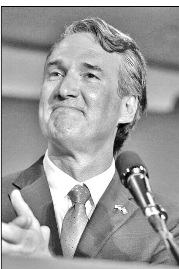
Glenn Youngkin SUBMITTED PHOTOS