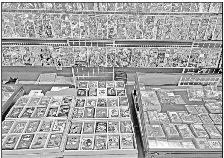
The 25th Annual Virginia Vintage Comics & Collectibles Show saw a "milestone" turnout at the Salem Civic Center on Saturday.