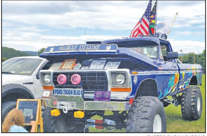
The Hillbilly Deluxe Ford truck was a hit with the kids as they were asked to draw the truck on the chalkboard with colored chalk.