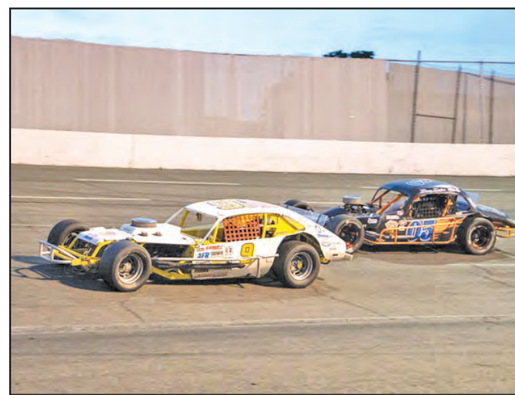
Classic cars competed at Motor Mile Speedway.

There is a bounty on Looney. If a new driver wins a late model race in the series, they get a bonus of $1,000 for winning. If Looney wins both races this weekend, then the bounty will increase the following week for the final two races in the series.