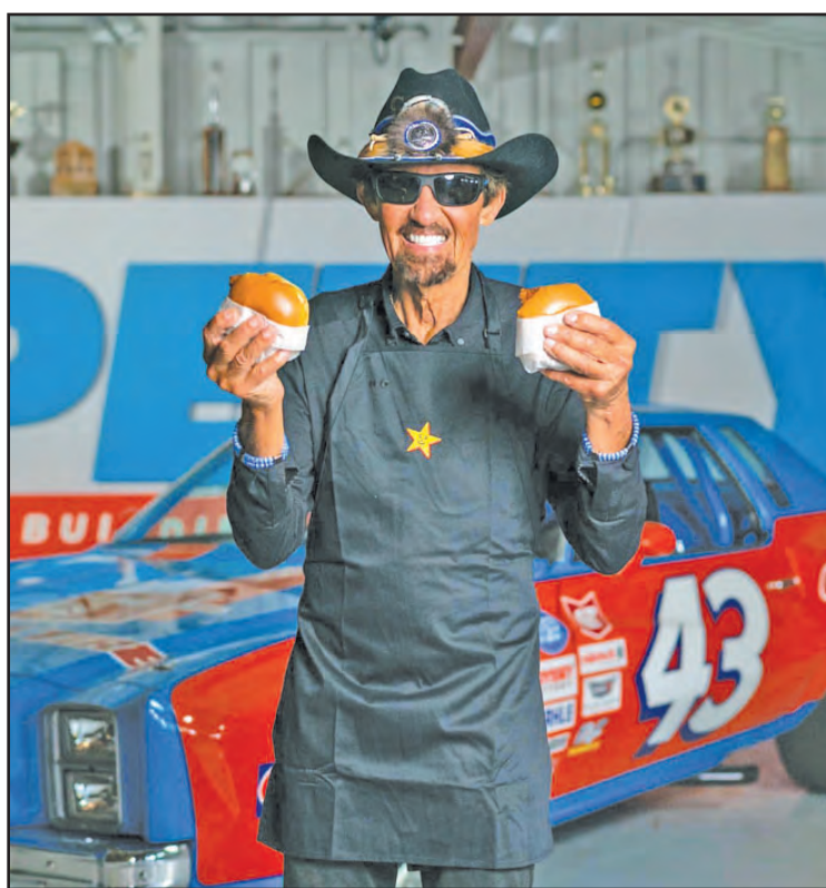
Richard Petty has his hands full with chicken sandwiches.