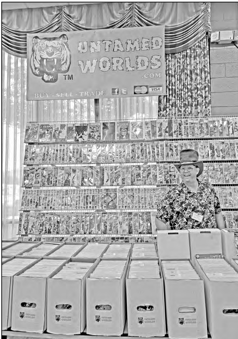
Untamed Worlds will host additional comic shows in Roanoke (Oct. 22) and Bristol (Oct. 29)