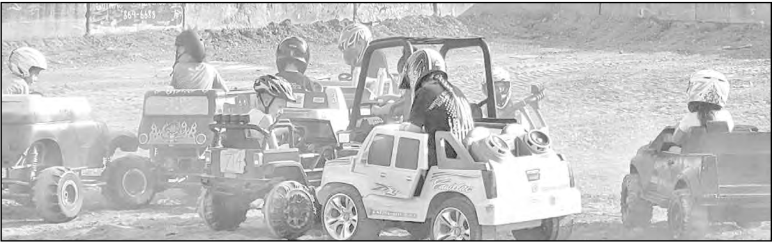
When it comes to derby, even the youngest kids know how in Craig County! They seem to enjoy playing demolition.