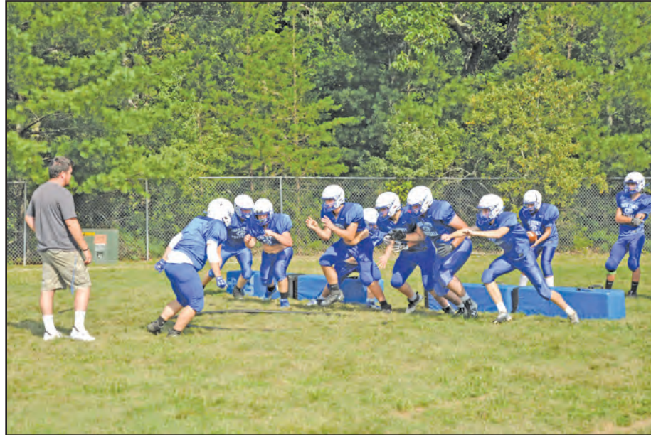
The Craig offensive line goes through drills.