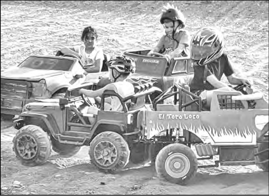
Several of the kids know how to ram each other. Some smile while others back up for another hit.