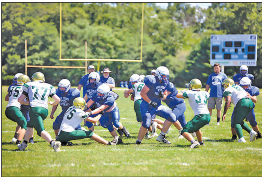
Rockets had one scrimmage this summer, against Patrick County.