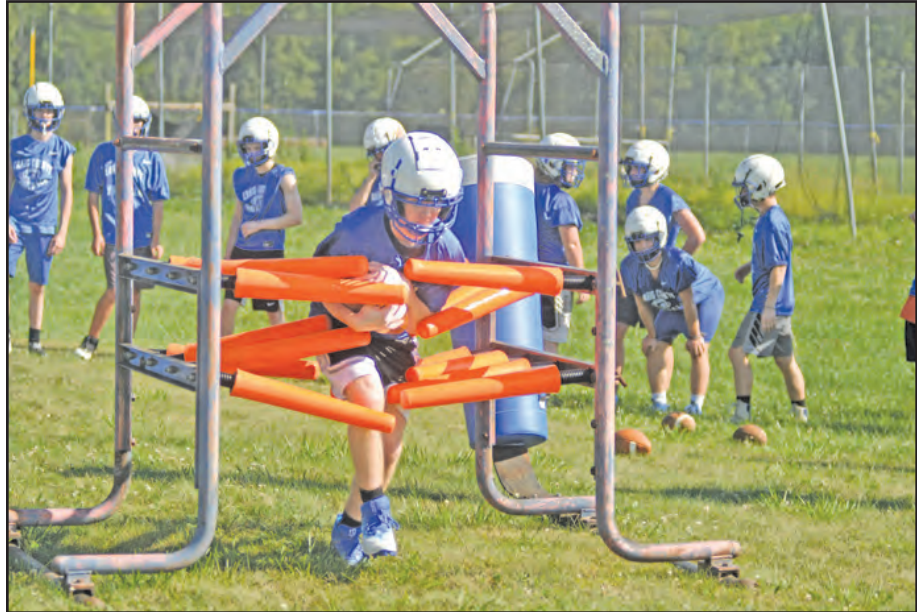
Rockets go through the "gauntlet" at a recent practice.