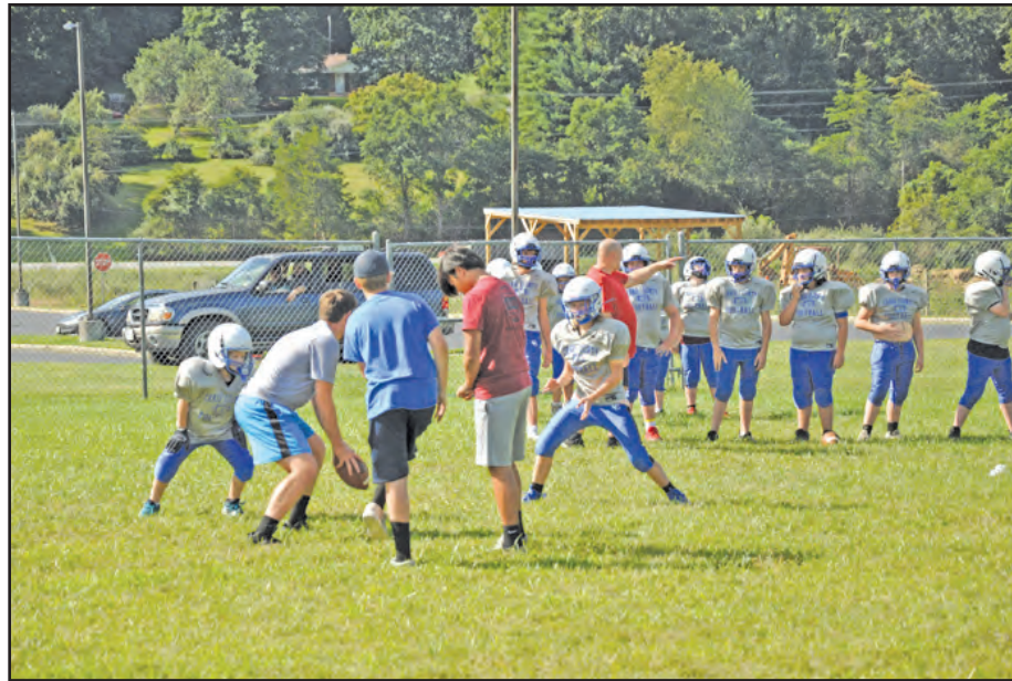
The middle school team practices.