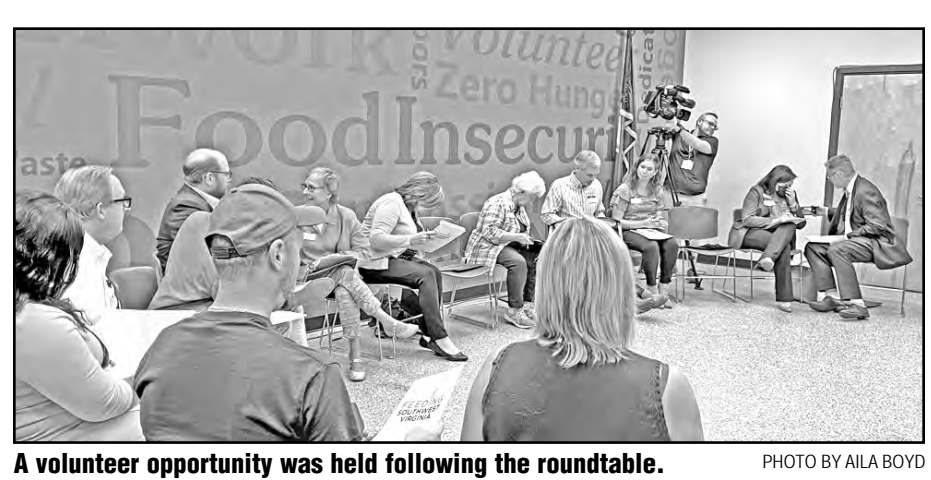
A volunteer opportunity was held following the roundtable.

The organization covers a region that consists of 26 counties and nine cities, including Craig County.