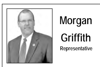
Morgan Griffith Representative

The Commitment to America calls for reducing wasteful spending to bring costs for essentials like housing and groceries under control. It also calls for tax and regulatory reform to grow wages, create good jobs, and stabilize the economy. After the pandemic