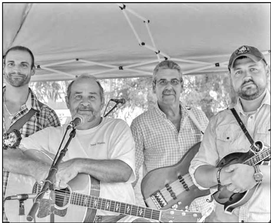
New Horizon Gospel