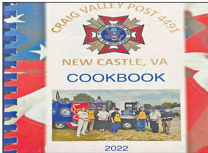
The local Craig Valley VFW Post 4491 has created its own cookbook with over 350 special recipes that likely can't be found elsewhere, along with veteran remembrances. The books will be available at the Fall Festival Oct. 8 for $15.