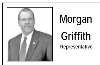
Morgan Griffith Representative

SBIR was enacted by President Ronald Reagan in 1982. It reserves a modest percentage of federal research and development dollars for small businesses. This approach produces technical innovation and lets small businesses perform projects prioritized by the Federal Government. It also creates a pipeline for federally supported research to be patented and brought to market. STTR was established ten years later and requires a small business to partner with a non-profit research institution, most often a university, to receive funding.