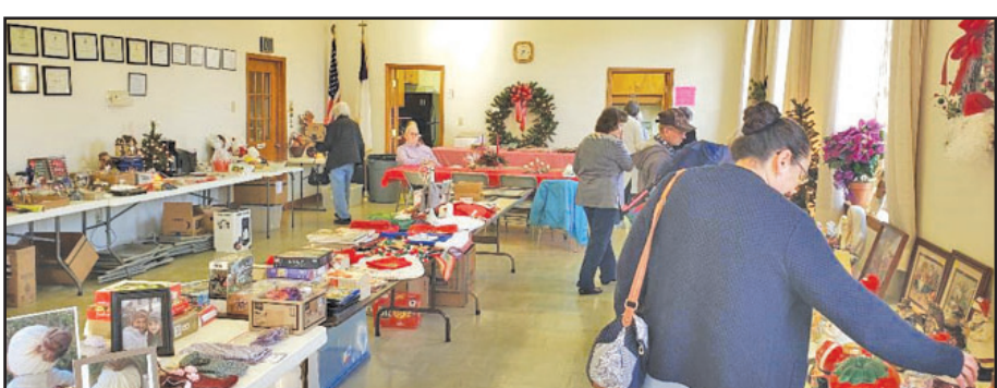
The New Castle Methodist Church annual Christmas bazaar was deemed to be a huge success as many were at the doors as it opened at 8 a.m. It seemed everyone left with something they purchased.