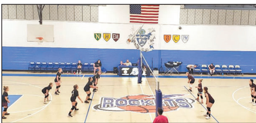
The younger girls of Craig County are learning and enjoying the sport of volleyball on the recreation teams.