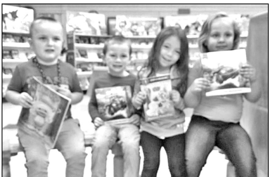
Ms. Carper's kindergarten class was excited to get $5 each from an anonymous donor to shop for books.