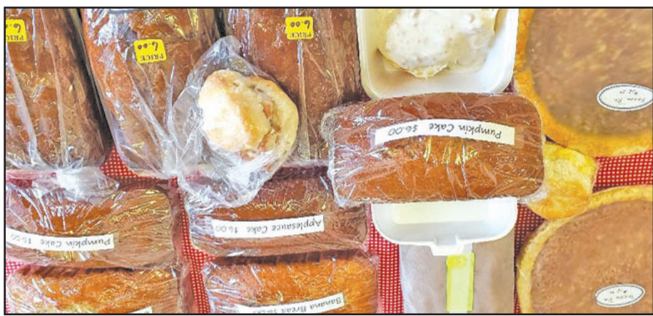
The homemade gravy biscuits, and other breakfast items, as well as the baked goods went fast as people bought two and three at a time.