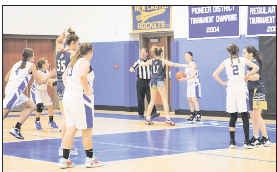
The Rocket middle school girls set up an inbounds play.