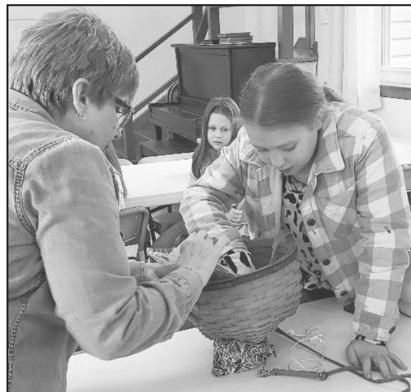
There were also prizes for the top seven kids that found the most eggs. Toddlers and bigger kids won nice prizes.

looked to their parents and friends to make sure they seen what they had gotten.