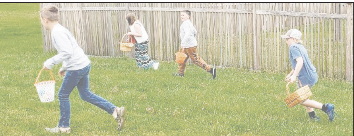
The bigger kids had no problem filling their baskets fast as they sprinted to the next egg they spotted, hoping to get ones with the cash hidden in them.