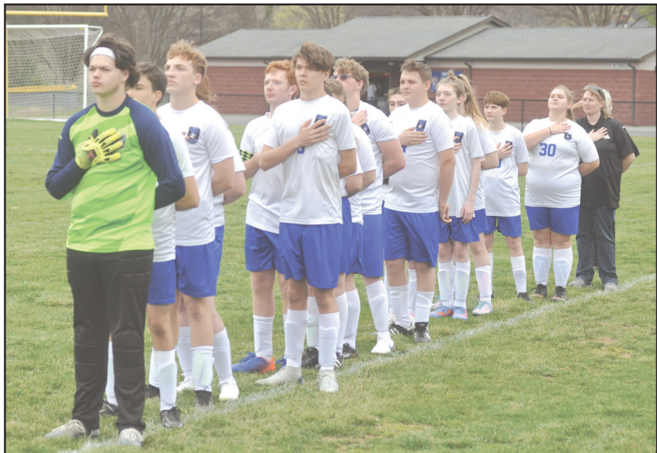
The Rockets stand for the national anthem prior to their opening game.

The Craig County soccer team will have their first home match of the season this Friday when the Rockets host Buffalo Gap at Mitchell Stadium. Game time is scheduled for 6 pm.