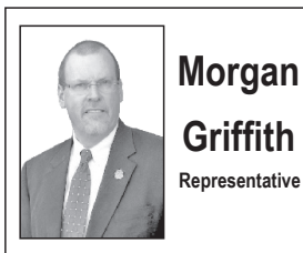
Morgan Griffith Representative

This Easter I want to revisit one of my favorite hymns, He Is Risen. Though I've shared this one before, the message of He Is Risen is enduring and its history fascinating. As any staff member who has ridden in the car with me during the Easter season knows, I love to talk about He Is Risen and about Joachim Neander, who wrote the music. In early April, both Christians and those of the Jewish faith will celebrate significant observances in their liturgical calendar. Members of the Jewish religion will be observing April 5-13 as Passover. Passover commemorates the time when the Jews were enslaved in Egypt, and one of the plagues Moses foretold was that each family would lose their firstborn son. This was true unless they placed the blood of a lamb on their doorpost. Thus, the plague would "pass over" the marked houses.