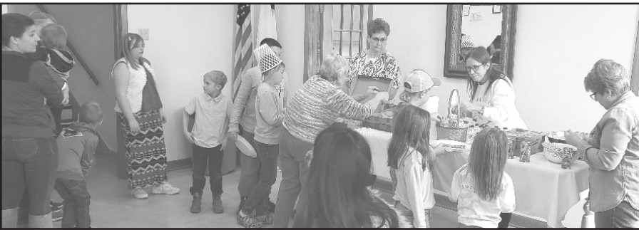
The Methodist church served them a nice lunch which all the kids seemed to enjoy.

Angel of the Lord had come down and pushed the stone away from the tomb where Jesus was buried. When the soldiers saw the angel, they fell to the ground! Mary was walking to the tomb to look for Jesus and she saw the angel and the angel told her, "Do not be afraid. Jesus is not here for He has risen. Go and tell the disciples that Jesus is alive!" they shared.