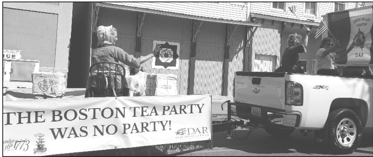
The Daughters of the American Revolution depicted the Boston Tea Party, adding to their float, The Boston Tea party was no party.