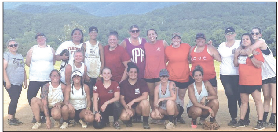
The ladies who took the win were the red Fireballs, winning the last game eight runs to five.