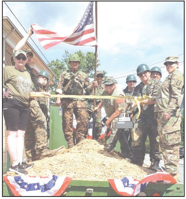
This year's winner was local Craig Valley VFW Post #4491, which also won last year's trophy. The float was a rendering of the raising of the flag at Iwo Jema.