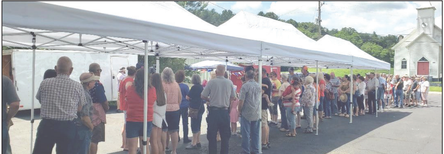
The annual Paint Bank Volunteer Fire Department Independence Day celebration brings people together from surrounding counties as they lined up before noon and the line continued for the next hour as more kept driving in to enjoy the $10 meal.

On Tuesday, July 4, about 300 people or more drove into the field at the fire department, ready to enjoy a chicken and ham