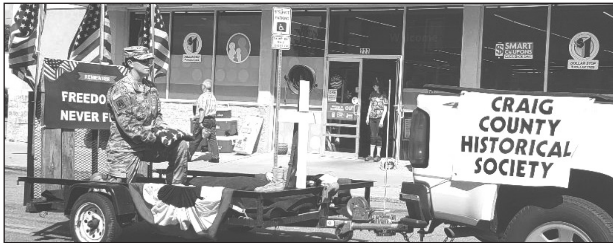
The Craig County Historical Society displayed the honoring of the fallen soldiers.

Many others decked their vehicles out with patriotic colors; however, another mindful float was that of the Craig County Historical Society. It was simple yet profound. A military person was kneeled on one knee, with a folded flag on her lap and in front of her was the standing rifle and helmet against a white cross and the combat boots positioned at the bottom. The sign said,