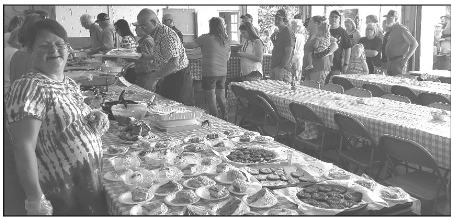
The food is prepared, served hot and there are multiple choices of sides and desserts that please everyone's taste buds.