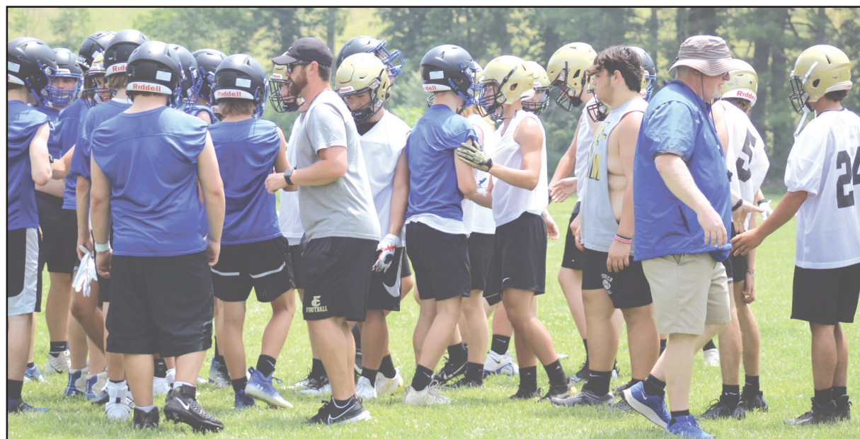
Craig County and Fort Chiswell players shake hands after their 7-on-7 scrimmage.