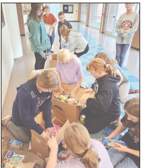
The Rockets CARE Middle School club chose to collect food for our local Department of Social Services as a recent project, as they heard about the need the DSS had.