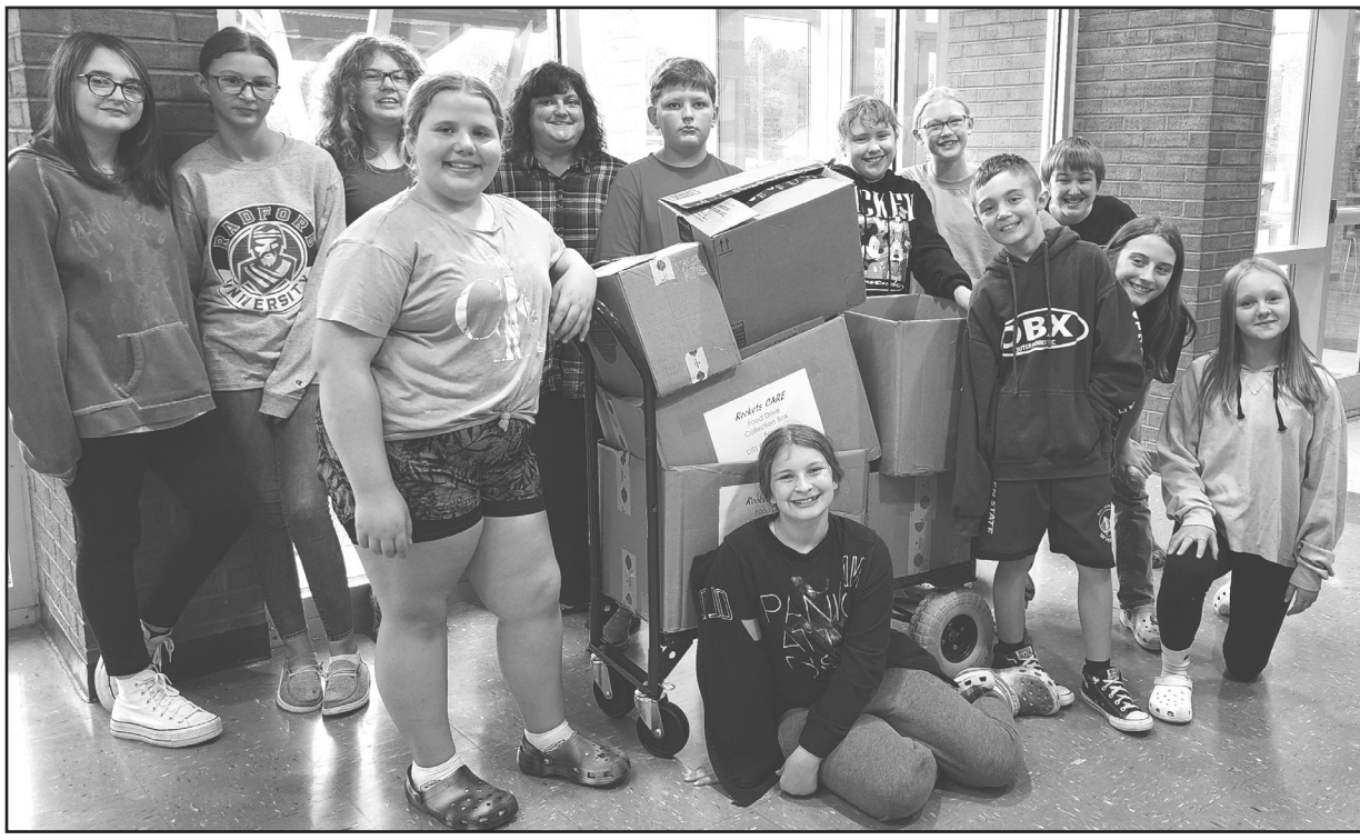
The Rockets CARE team packed the boxes of food they collected from the schools.

Huffman declared their first food drive project a success and was very proud of the students who worked hard on this collection effort.