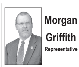
Morgan Griffith Representative

On October 3rd, a motion to vacate was brought to the House floor and eight Republicans voted with Democrats to oust the Speaker of the House Kevin McCarthy.