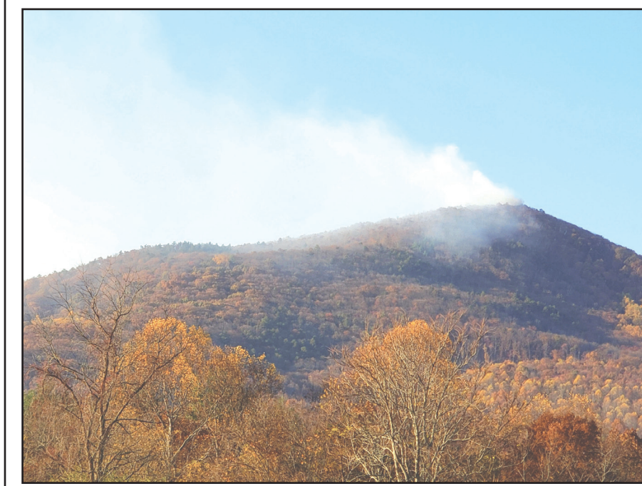
The scenic drive was cut off early on Route 42, Cumberland Gap Road, due to a fire. It was reported that a tree fell over a power line which looked to start it. It was closed for a short period of time. Firefighters were called in and as of Monday morning it was said to be 75% contained.