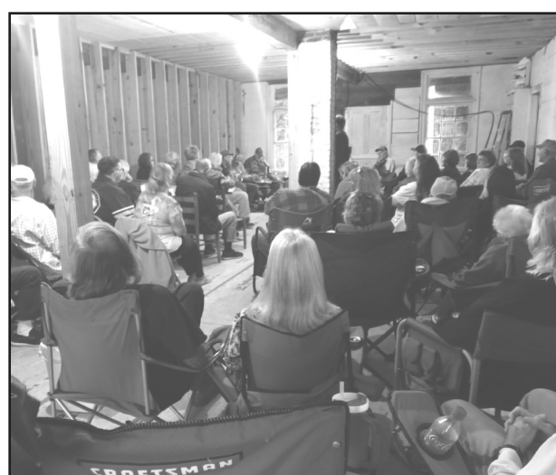
SUBMITTED BY CRAIG COUNTY HISTORICAL SOCIETY

The Historical Society is pleased to announce that almost $1,800 in donations was collected