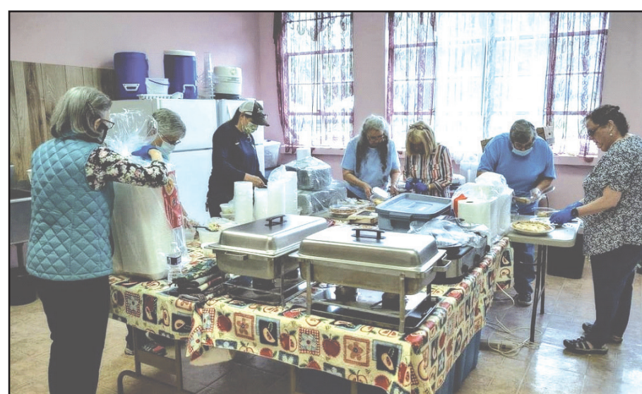
The supper will cost $15.