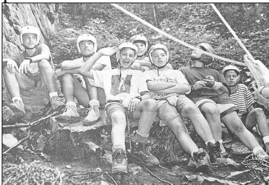
FROM THE NCR ARCHIVES

History is taught by acting out historical events and visiting historical