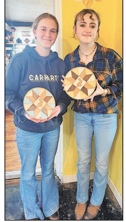
Participants made barn quilt style decor. The event was recently held at Hive Cafe.