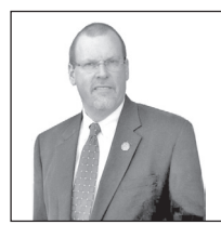
Morgan Griffith Representative

of the 118th Congress to continue without termination.