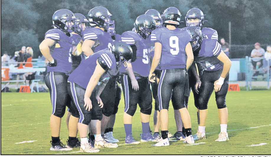
Rockets huddle at a recent game.

The Generals scored next on a screen pass to close the gap to 17-12, as Craig's defense stopped the two-