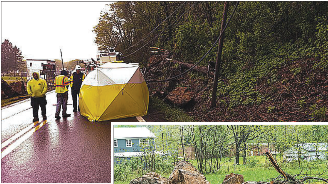
TOP - Crews work to restore phone service after the rockslide.