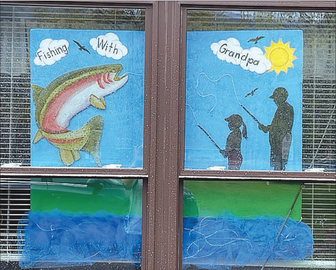
The Senior Center in Franklin earned the runner-up award in the Trout Fest overall window display category.