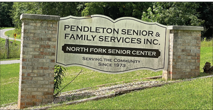
North Fork Senior Center serving the community since 1973 will close its doors on Sept. 30.