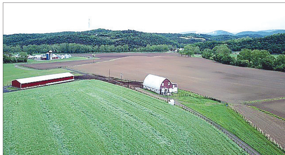
Overhead view of the Mallow Farm

Through the years, the farm has seen many changes, developments, and additions. What once started