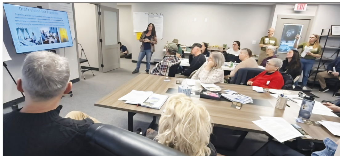
The second of three community development meetings held by Mon Forest Towns brought 30 area leaders, stakeholders, and interested residents together.