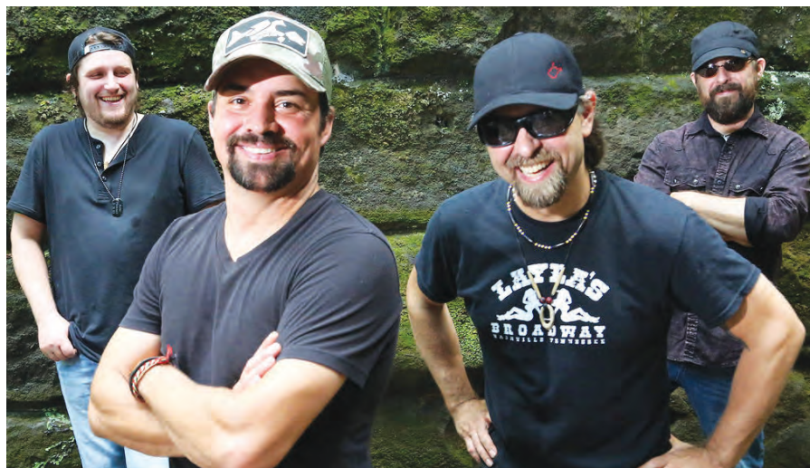
Davisson Brothers Band - Saturday, 9 p.m., Main St. Stage

Saturday's entertainment includes a 5K and Kids Run at 8 a.m. (registration begins at 7:30) and (Continued on Page 3)