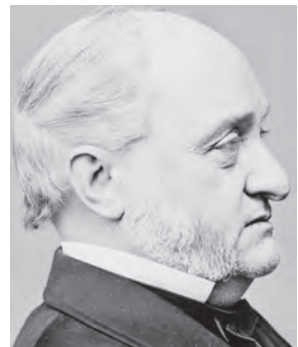
Sept. 7, 1808: Peter Godwin Van Winkle was born in New York City. He was elected as one of the first two U.S. senators from the new state of West Virginia.