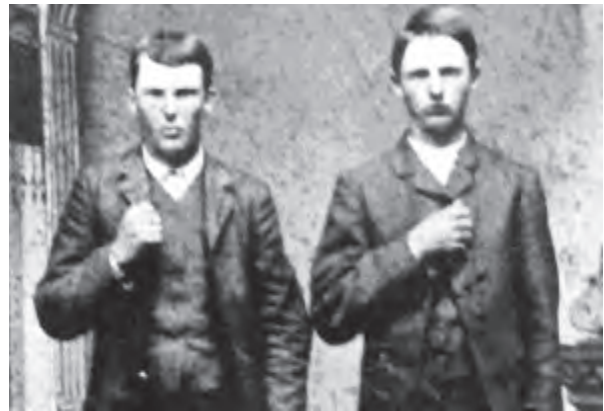
Members of the notorious James Gang, including Jesse (left) and Frank James, robbed the Bank of Huntington on Sept. 6, 1875.

The following events happened from Sept. 2-8 in West Virginia history. To read about West Virginia's people, history, places, science, arts and culture, visit www.wvencyclopedia.org .