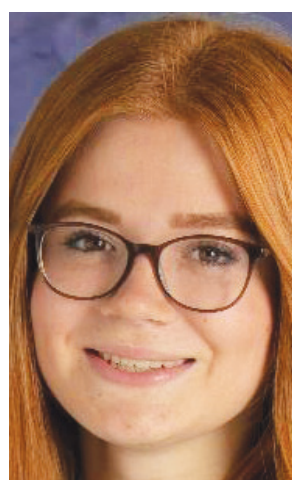
Kinlea Church Merit Scholar Top History Scholar