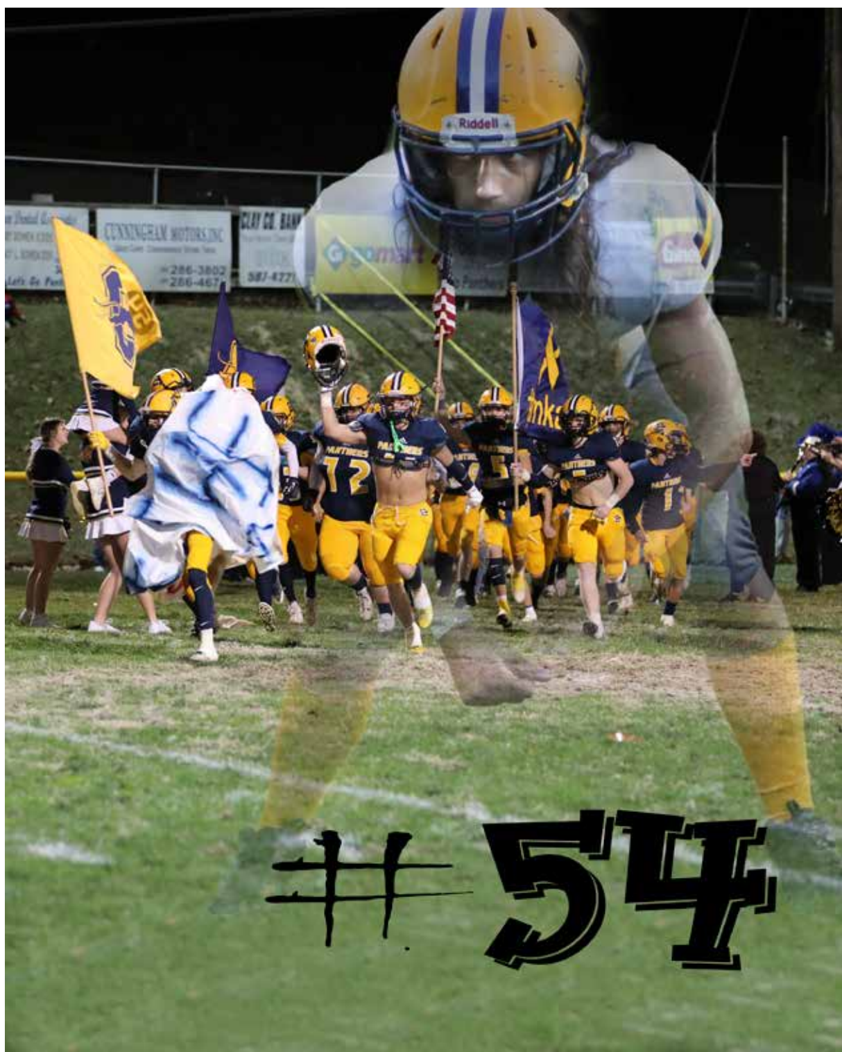
The 2022 Panther team hits the field for the last time.