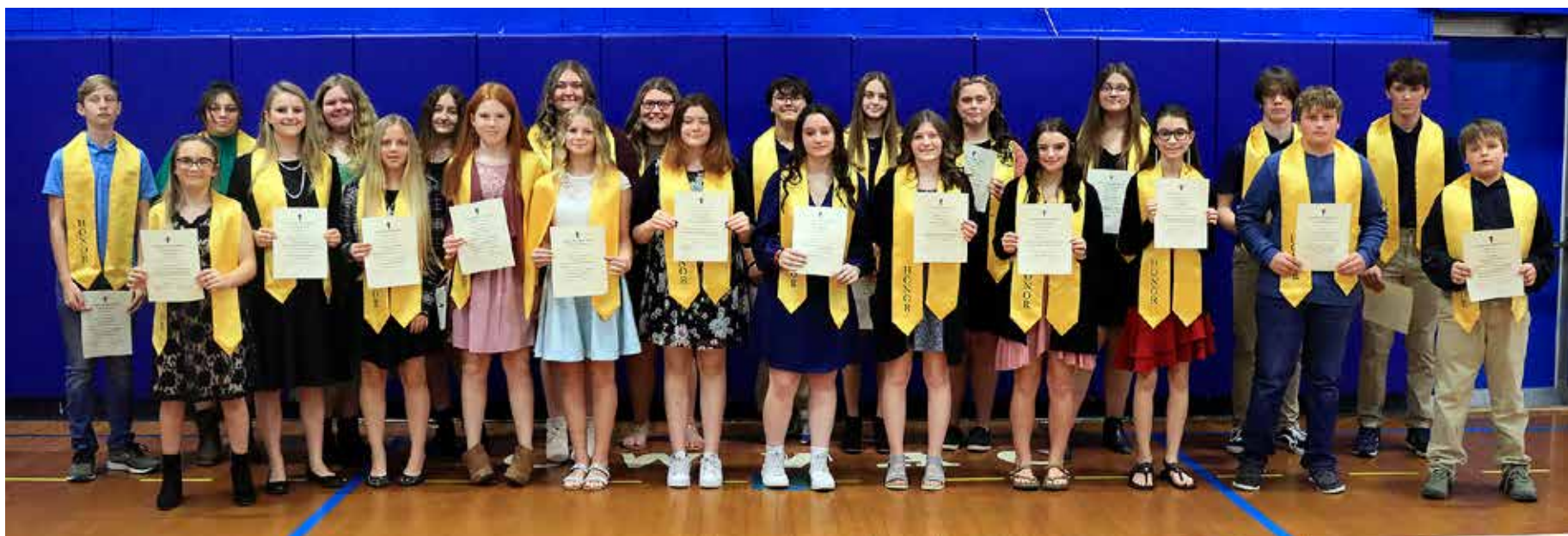
CCMS National Junior Honor Society inductees 2022.