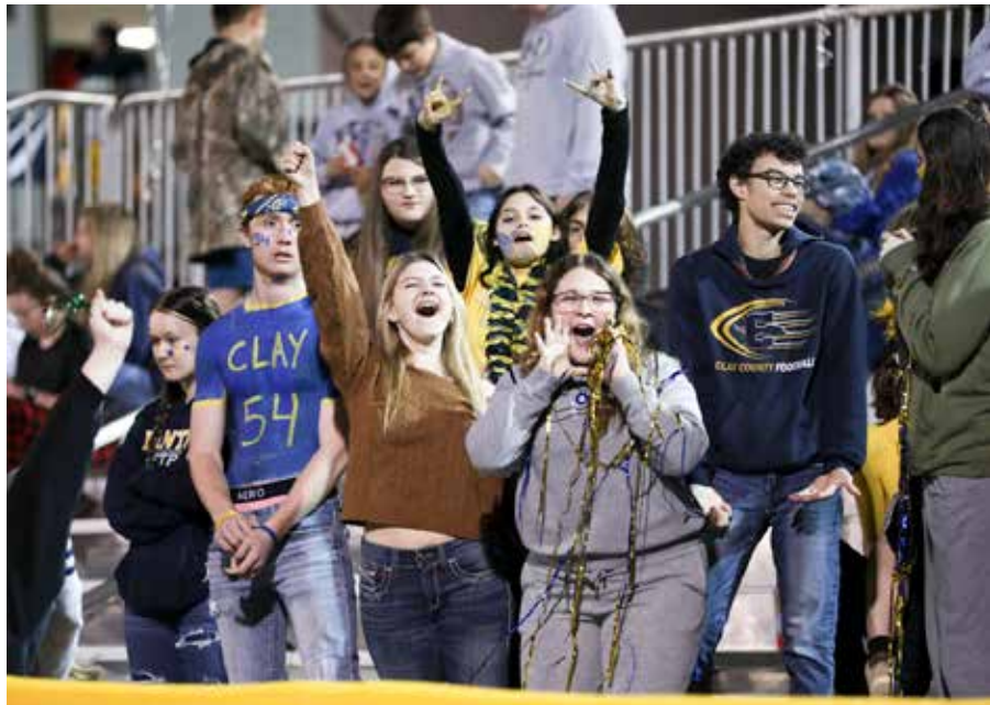
The fan section was pumped.