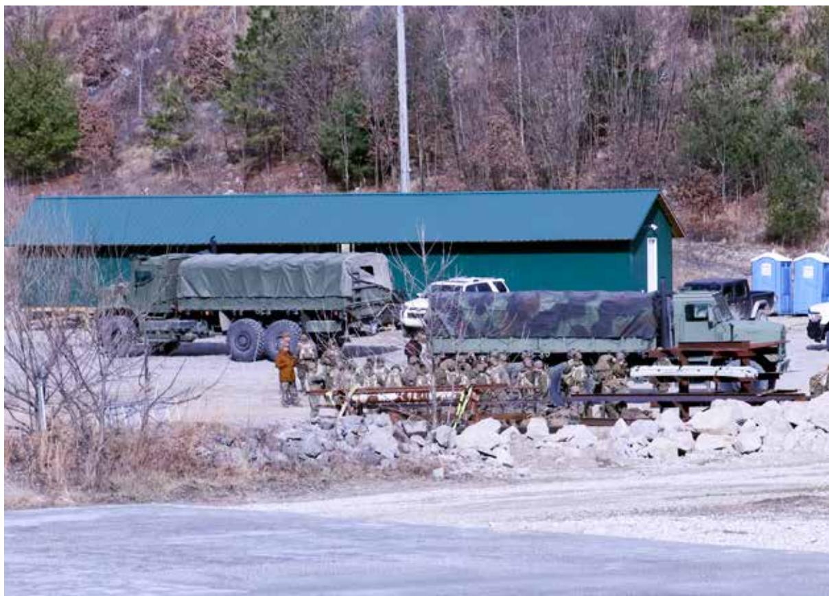
The 124 th Reserve getting set for training.