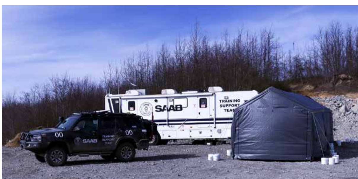
SAAB getting set up for testing.

and disaster communication to creating war time and disaster scenarios for the military and civilian response units.