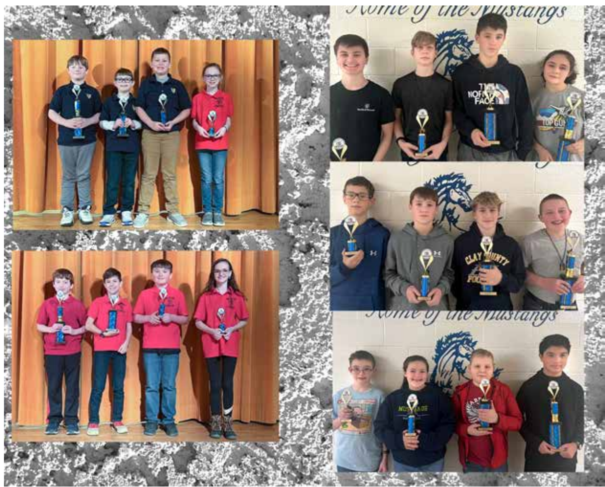
Left side top to bottom- 4 th grade winners , 5 th grade winners. Right side top to bottom- 8 th grade winners, 7 th grade winners and 6 th grade winners.