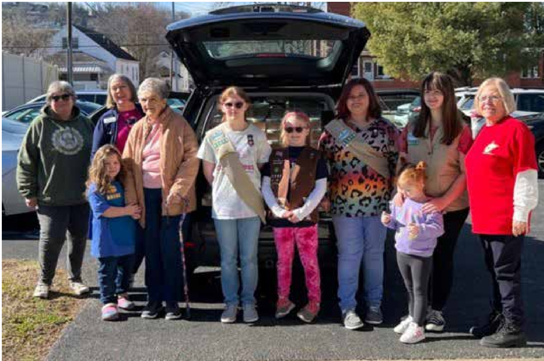
The Girl Scouts of Black Diamond partners with the West Virginia Gold Star Mothers Association, a service organization of women who have lost sons and daughters in the military, and the West Virginia National Guard Foundation to distribute nuts and candies to the military. WVGSMAs distributes to VA hospitals, nursing homes, disabled and paralyzed veterans, and more.

The Girl Scouts of Black Diamond Council donated nearly 2,000 packages of nuts and candy to local veteran organizations as part of the Care to Share program.