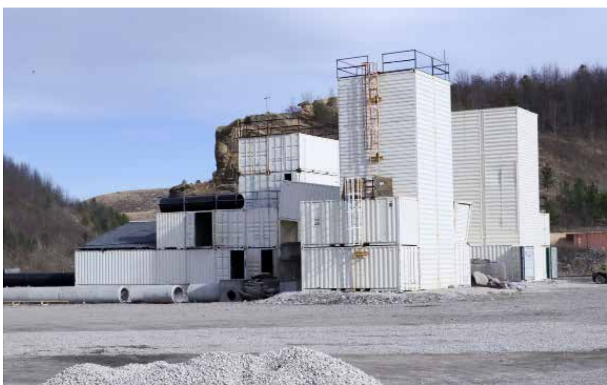
Container facility used for extensive training.