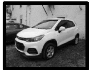
2017 Chevy Trax