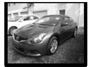
2012 Nissan Altima