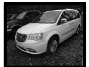
2013 Town & Country