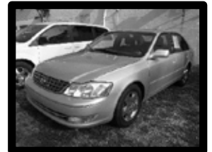
2003 Toyota Avalon