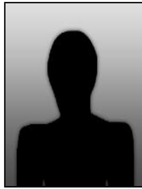
No Photo Bobby Allen Stillwell Booked 1/5/24 Capias