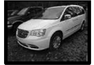
2013 Town & Country