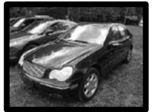
2004 Mercedes Benz