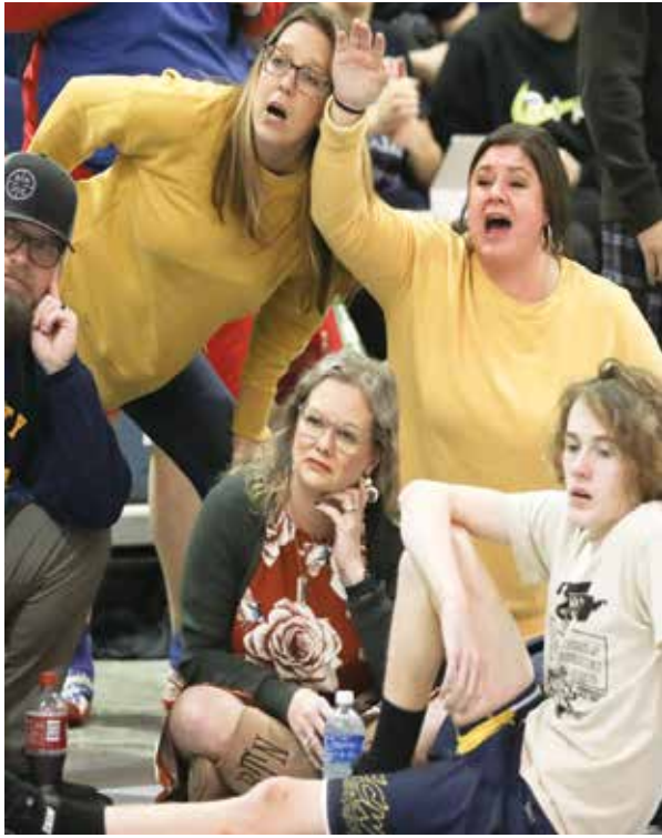
Coaching mothers get in some mat time.