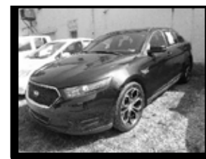
2015 Ford Taurus SHO