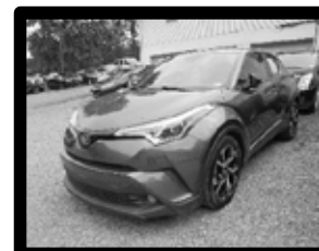
2014 Toyota C-HR