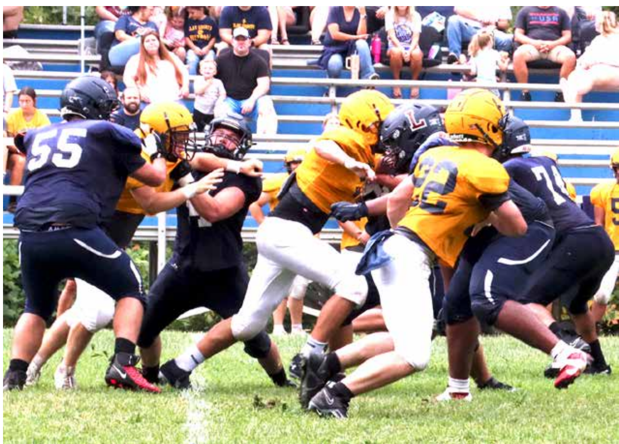
The Panther defense pushes for the backfield.

There were a few mishaps, but all in all, it was a good look at what they needed to work on before the season opener with Midland Trail on August 30, game