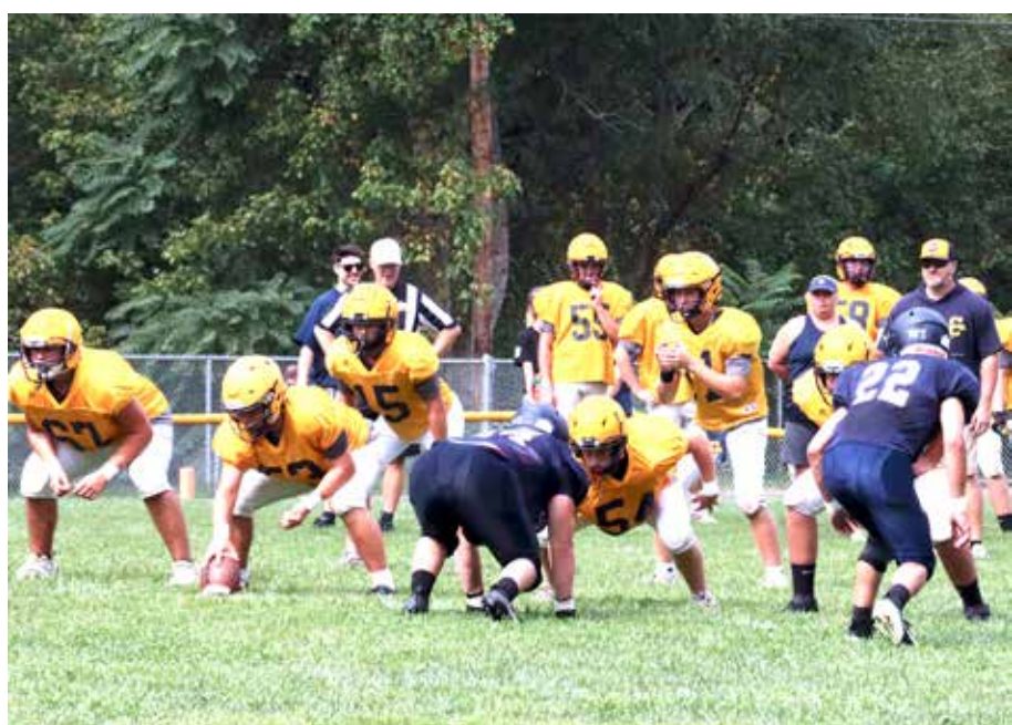
Panther JV sees what they can get done.

VISIT US ONLINE AT CLAYCOUNTYFREEPRESS.COM