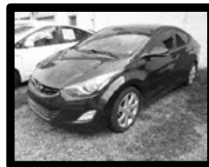
2013 Hyundai Elantra