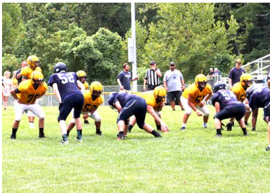
The Panther offense sets up a play.