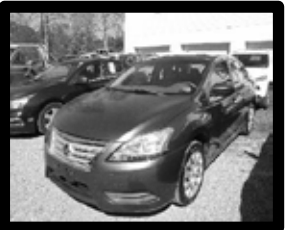
2014 Nissan Sentra