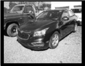
2016 Chevy Cruze