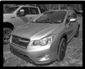
2015 Subaru Crosstrek