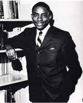
Sept. 10, 1887: Author

Sept. 10, 1861: The Battle of Carnifex Ferry took place on the Gauley River. Union Gen. William Rosecrans sent in brigades one at a time as they arrived at the battlefield, allowing the outnumbered Confederates to repulse the piecemeal attacks. During the night, the Confederates retreated before they could be defeated in the morning.