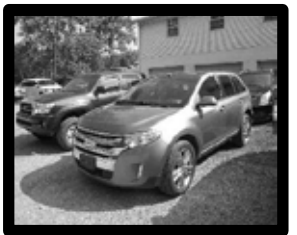
2013 Ford Edge