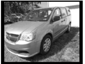
2014 Grand Caravan