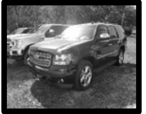
2011 Chevy Tahoe