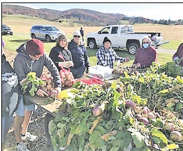
Twenty-eight members of the Thrasher youth group, families, and the Ten Brave Christians group spent Sunday afternoon on November 14 gleaning for turnips at Windy Hills Farm in Riner for distribution to local food banks. They gathered about a ton of turnips.