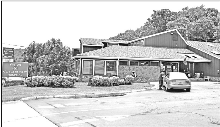
The Vinton Veterinary Hospital on Washington Avenue has announced plans for extensive expansion and renovations.