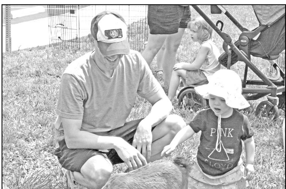
Pygmy goats were popular with the toddlers at the Summer Reading Kickoff.