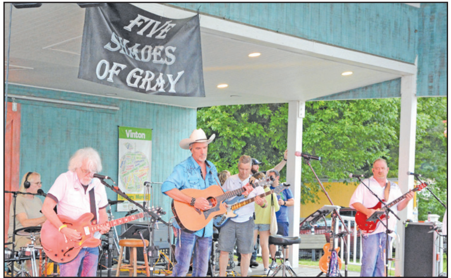
The Five Shades of Gray band was the featured performer at the first Mingle at the Market concert for 2022.

The Vinton Area Chamber of Commerce hosted the first Mingle at the Market concert of the 2022 season on June 11 with a performance from the Five Shades of Gray band.