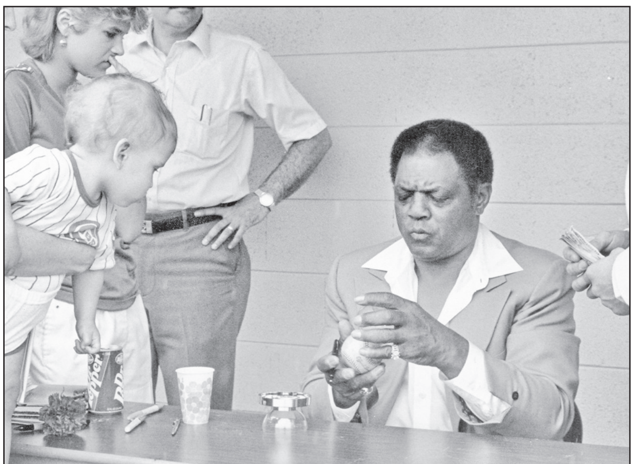
Willie Mays signs an autograph for a young fan on “Willie Mays Night” at the Salem Redbirds game in 1985. Willie turned 91 last month and that fan is now 37.