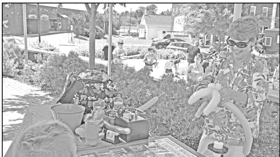
Lib's Lab provided twisted balloon animals. This one becomes a puppy.