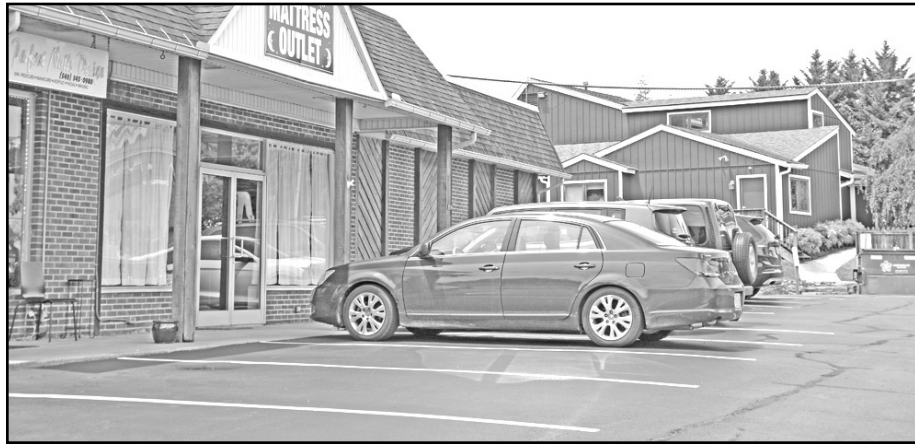
The old Sweet Dreams Mattress Store on Washington Avenue next door to the Vinton Veterinary Hospital is part of the expansion plan.