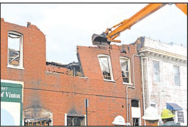
Demolition crews bring down the D.R. Music wall on Pollard Street.