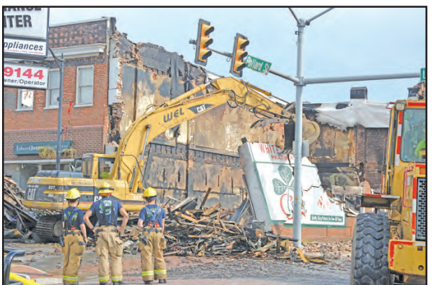
The iconic Clover Creamery sign falls.