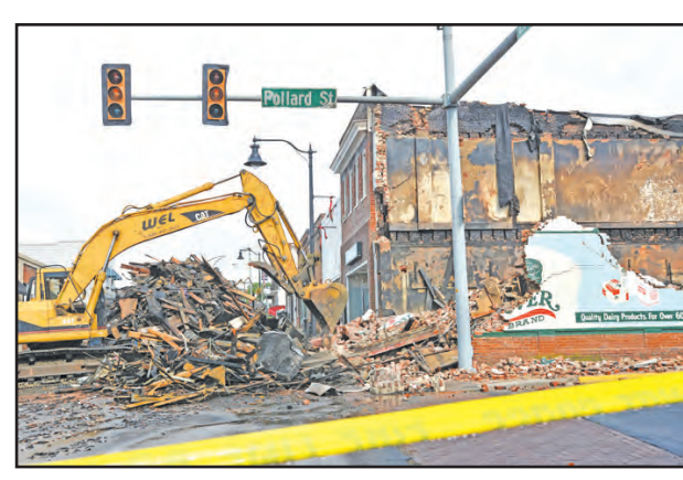
Downtown devastation with the loss of a piece of Vinton’s history.