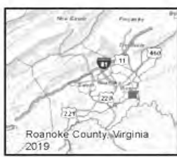
Blue Ridge Parkway Roanoke River Bridge Closure

This project has included concrete repairs to bridge piers, reconstruction and drainage repairs to approach areas, removal of existing asphalt surface and waterproofing membrane, installation of new waterproofing membrane and asphalt surface, and repainting of the steel super structure of the bridge.