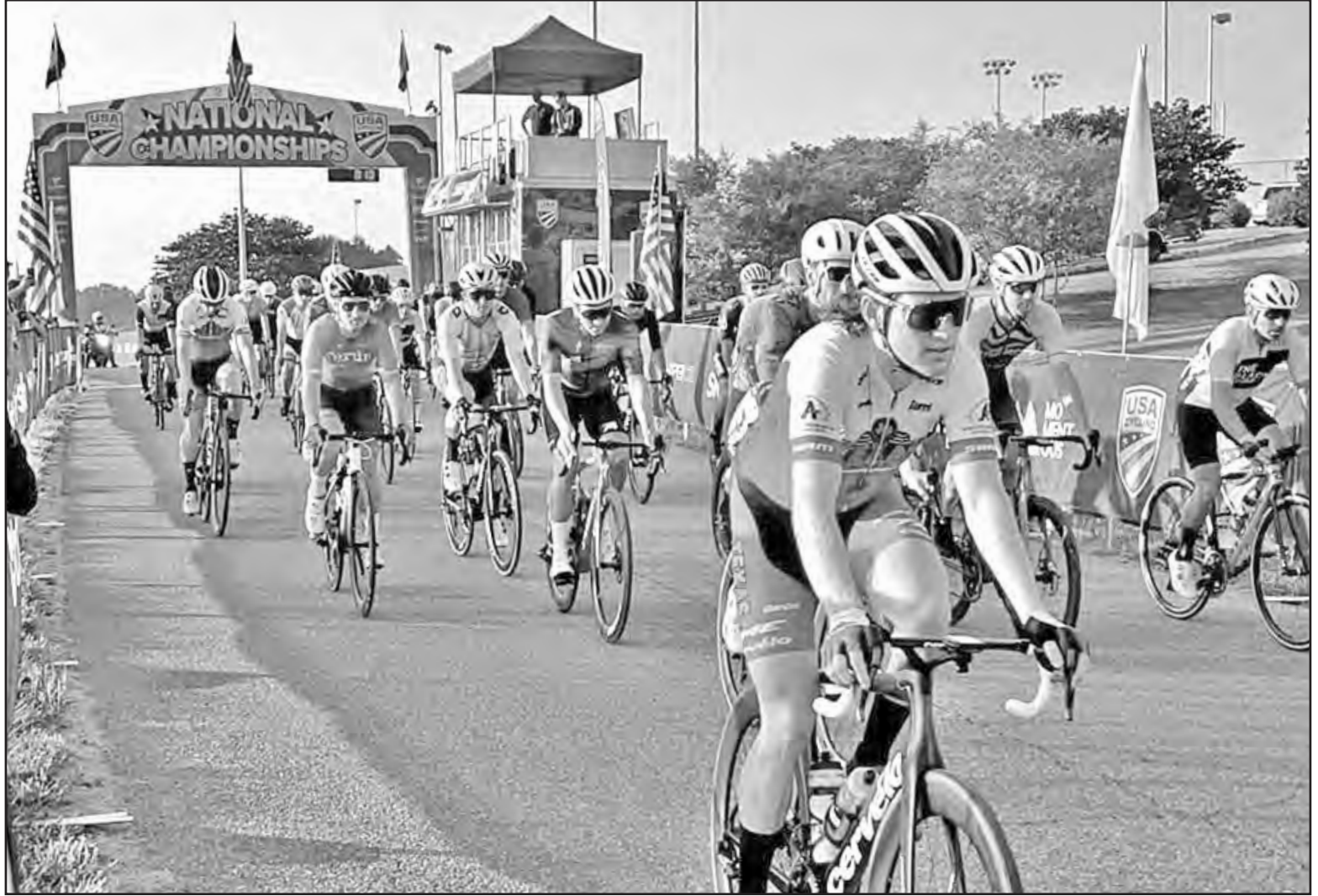
Cyclists are off and peddling in last week's 2022 USA Cycling Amateur Road National Championships, that had a starting point at the Botetourt Sports Complex on Thursday and Friday. The event covered four days of racing on area streets and trails.

Virginia's Blue Ridge is home to excellent cycling assets as America's East Coast Mountain Biking Capital including a Silver-level Ride Center designation from the International Mountain Bicycling Association. Region-wide the area has excellent road cycling on the Blue Ridge Parkway and greenways as well as emerging gravel trails.