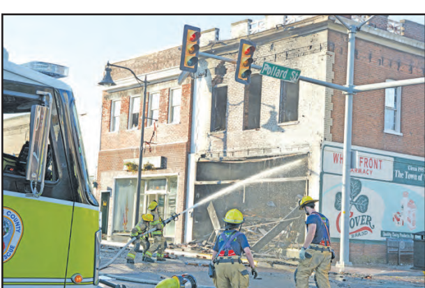
Crews extinguishing hot spots at D.R. Music early on July 2.

Thursday, July 7, 2022 • Dogwood Capital of Virginia • Covering Vinton, Bonsack & Stewartsville (USPS-660-020) OurValley.org • $1.00