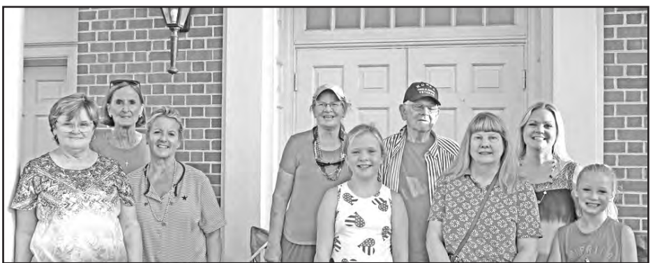
Thrasher Memorial UMC served up a Fourth of July favorite— free ice cream.