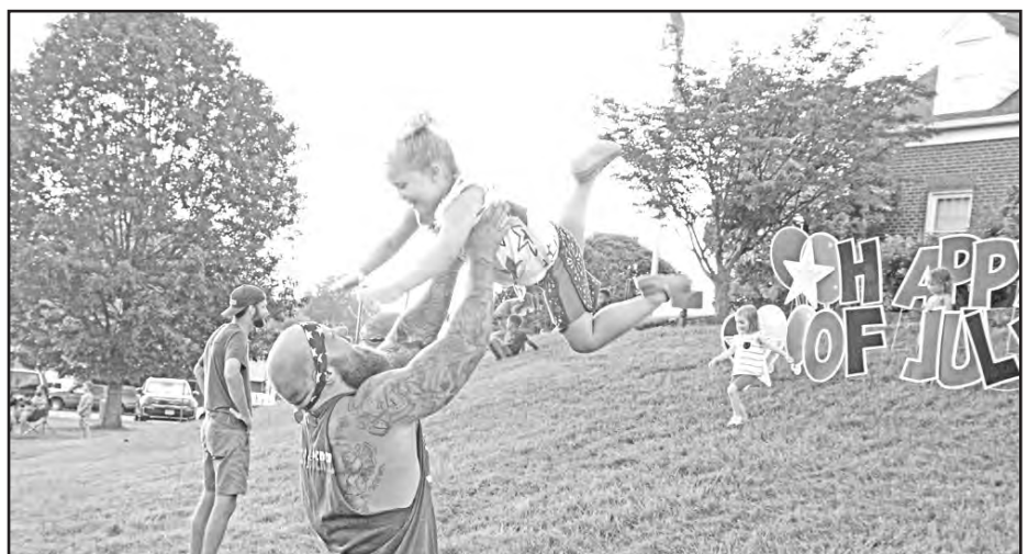
Families enjoyed the simple things in celebrating the Fourth at the War Memorial.

Vinton is not as small as it once was, except in remaining a tight-knit community, but it still defines Americana at its best.