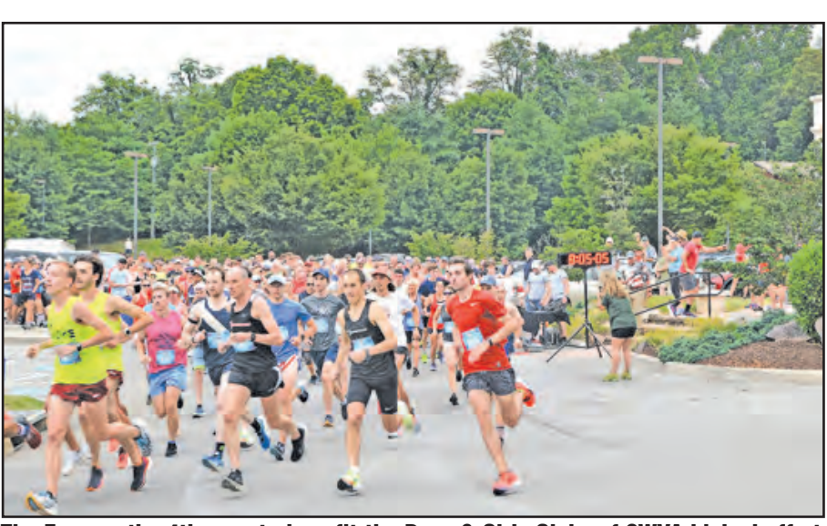
The Four on the 4th race to benefit the Boys & Girls Clubs of SWVA kicked off at the Vinton War Memorial High Ground Monument at 8 a.m. on July 4 – run for the first time in Vinton.