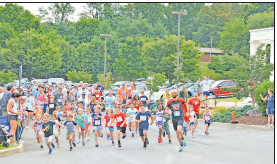
The Four on the 4th event also included a Kids Fun Run, starting off from the Vinton War Memorial at 9 a.m.