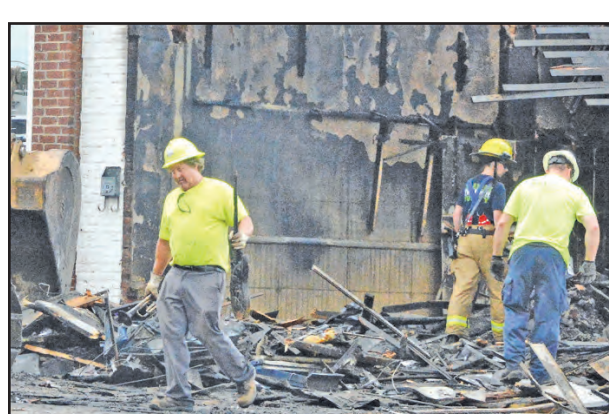
Demolition crew workers recover musical instruments after the fire.