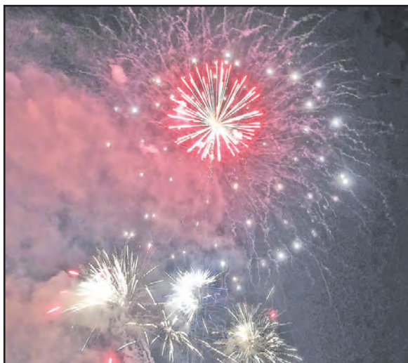
The Vinton Fourth of July Celebration fireworks were spectacular, once again.