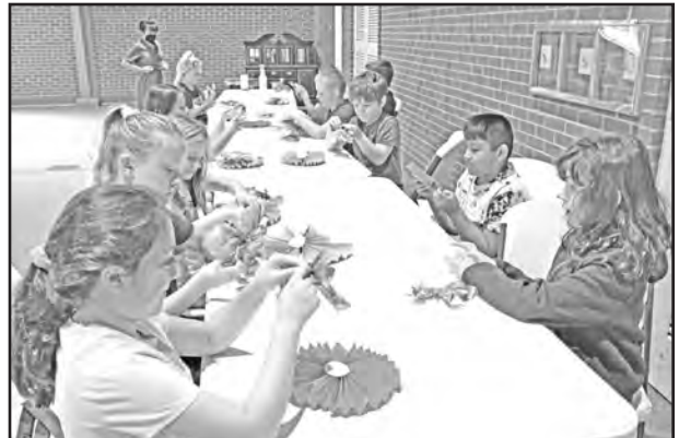
Campers created the sets and decorations for the "Encanto" production.

As an independently owned and operated non-profit organization, VCT is the professional theatre