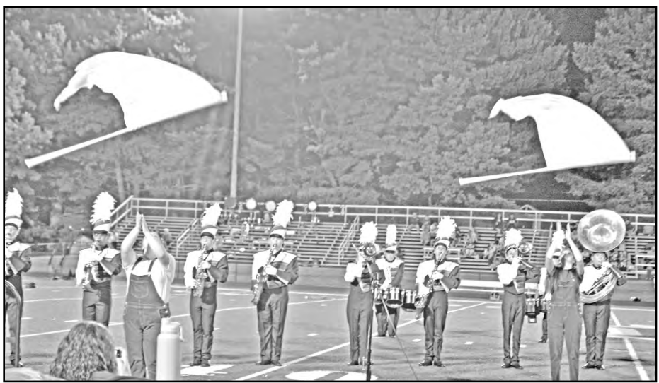
The Marching Terriers performed their halftime show "Ready of Not" about the joys of childhood.