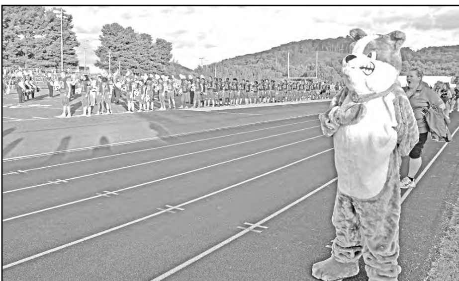
The Terrier Mascot leads the Pledge of Allegiance before the game.