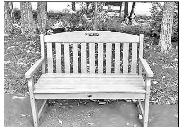
The DAR has received a bench from the Trex Corporation as the result of a successful recycling program with the DAR, the Town of Vinton, PFG, and Food Lion. The bench will be placed on an area greenway trail.