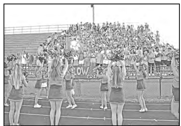
The William Byrd cheerleaders and Dog Pound kept spirits up during the game.