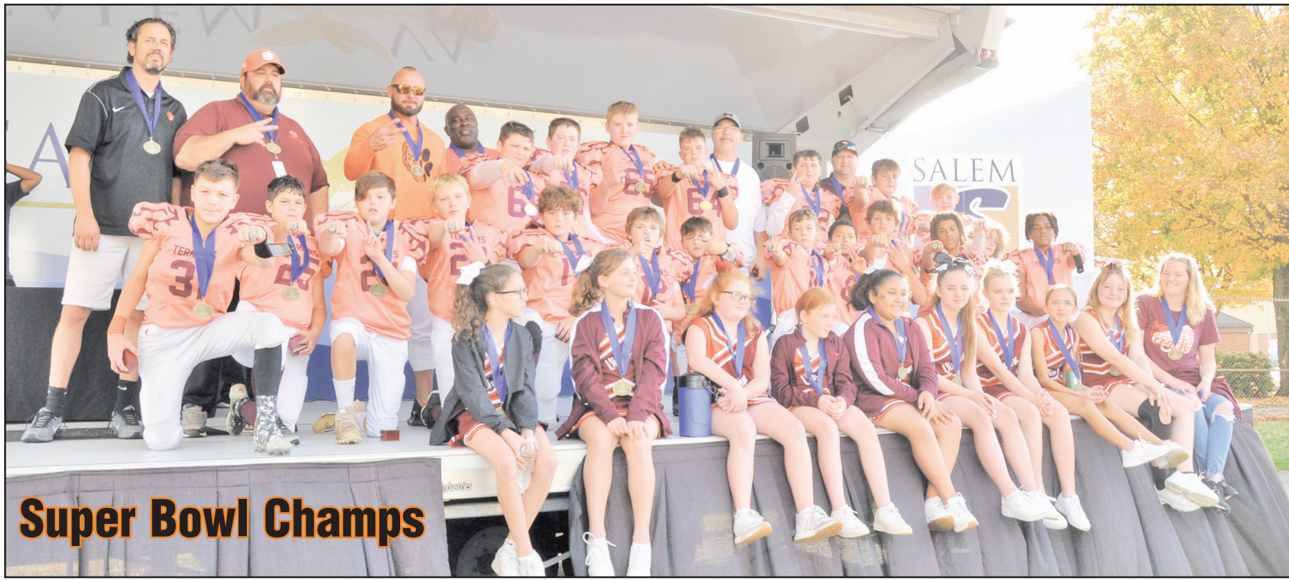
The Vinton Terrier football team and cheerleaders are on the stage at Salem Stadium after winning the 12U Sandlot Super Bowl Saturday. Vinton beat Cave Spring 8-0 for a fitting ending to an undefeated season. More photos on page 9.

Vinton's game was the third of three Super Bowl championships at Salem Stadium last Saturday. In the opener Salem beat Franklin County in the 8U final and the Salem Maroon team beat the Salem White team in the 10U championship.