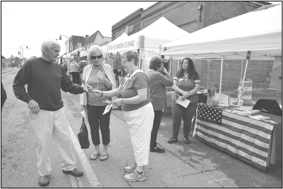
Members of the DAR handed out American flags at the Vinton Dogwood Festival—one of over 100 vendors on site.