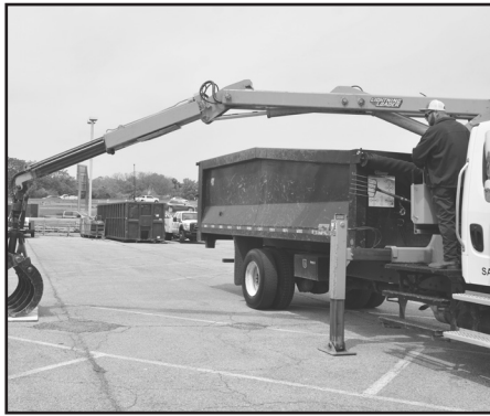
Jason Davison picks up a brick, swings it around the truck and places it on a target using the hydraulic arm of the knuckleboom.