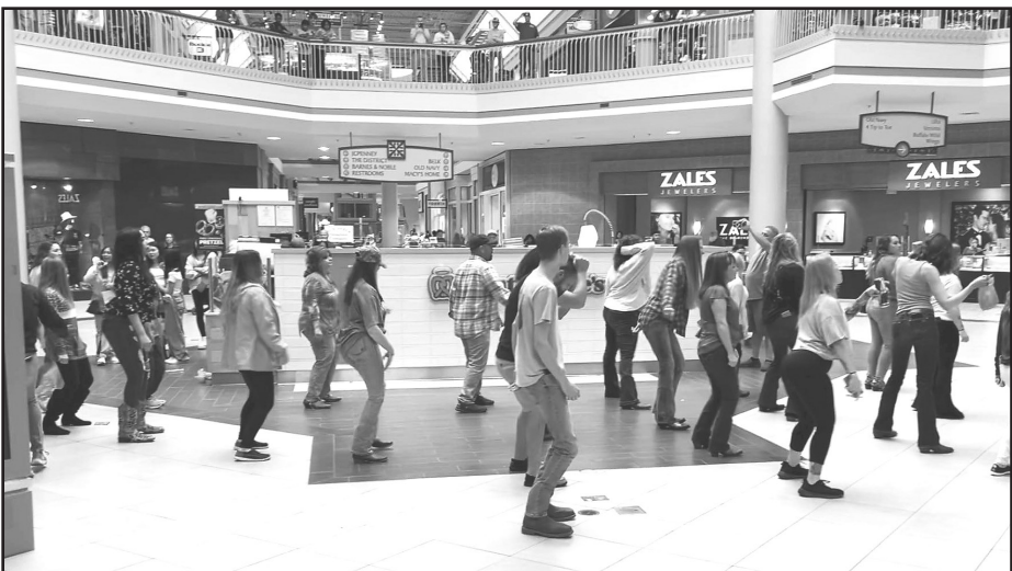
Dance Flash Mob at Valley View Mall.