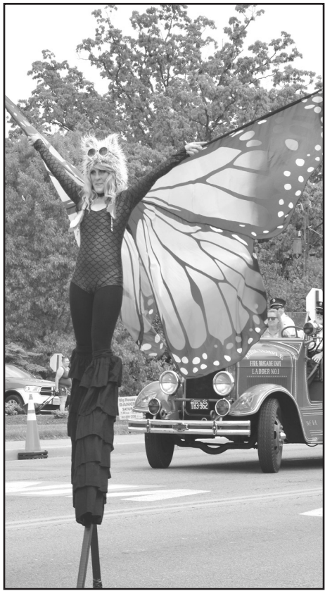
The butterfly stilt walkers have become popular entries in the parade each year.