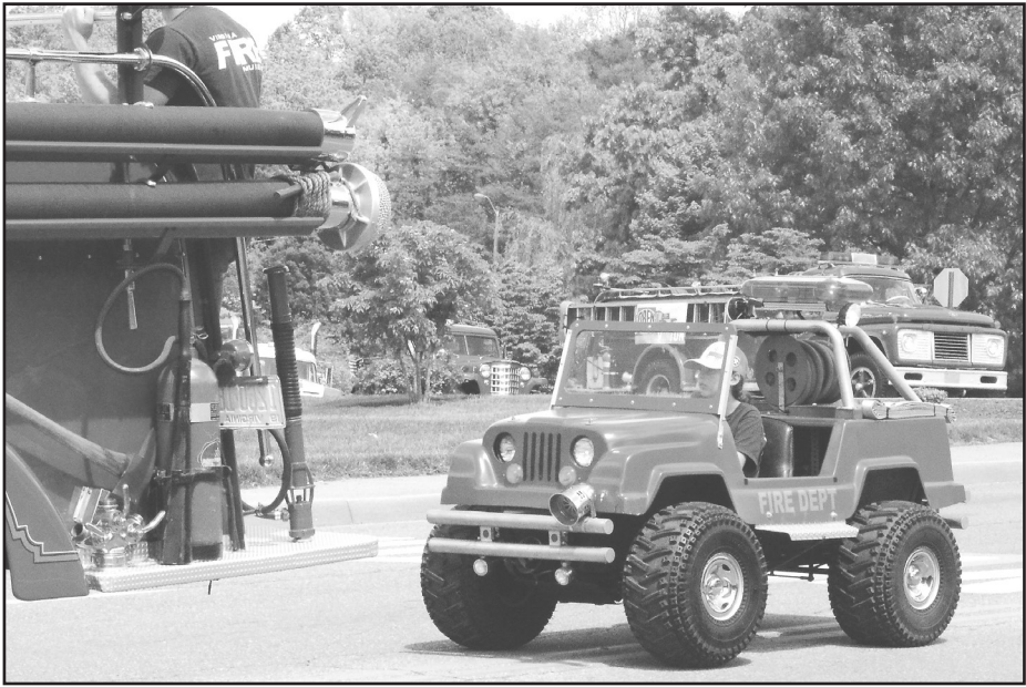
The Dogwood Parade was filled with fire engines of all sizes, most from the Virginia Fire Museum, Inc. in Roanoke.