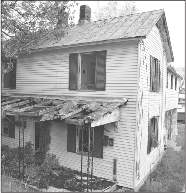
The nearby home that will be demolished as part of the Cleveland Mart project.