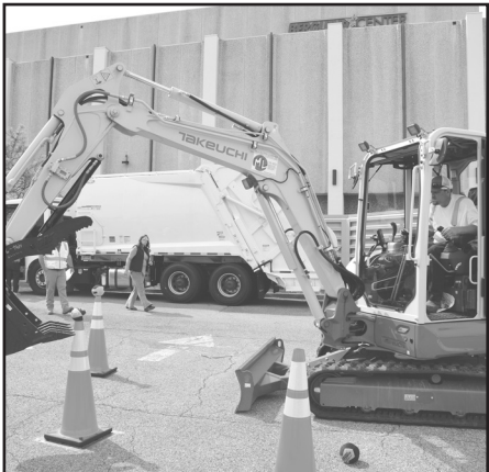
Billy Robb participating in the mini-excavator competition.