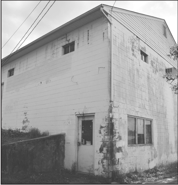
The “tower” at the Cleveland Mart, which will be redeveloped into apartments.

The MOU outlines a plan for a collaborative relationship between Vinton,