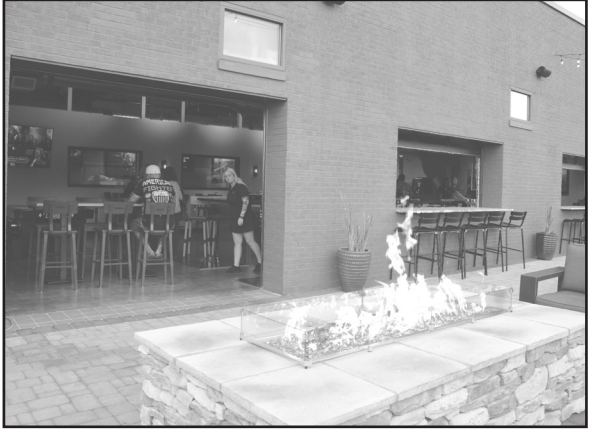
Outdoor patio and fire pit at Pollard 107 South