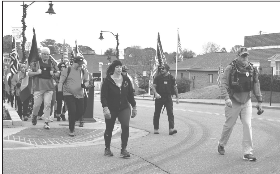
Participants walked a five-mile loop through the town carrying weighted backpacks to raise funds for Boulder Crest Foundation.

Rucking is a form of exercise with roots in military training.