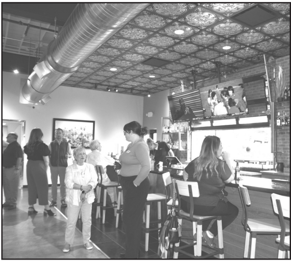
The interior of Pollard 107 South with steel-topped bar and metallic tile ceiling

Although the restaurant fronts on Pollard Street, parking will not be an issue. There is parking at the nearby Vinton Farmer's Market, behind the Post Office, and construction is