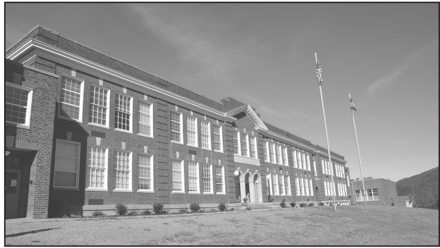
The former William Byrd High School