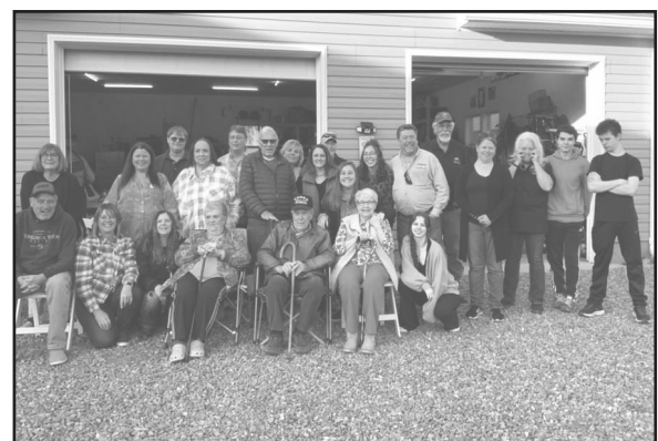
Chewing Fall Classic