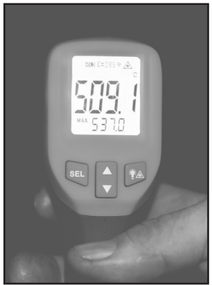
Temperatures reach over 500 degrees in the flag retirement incinerator device.

Doran kept adding flags to the incinerators late into the evening and is tentatively planning another flag retirement event next month.