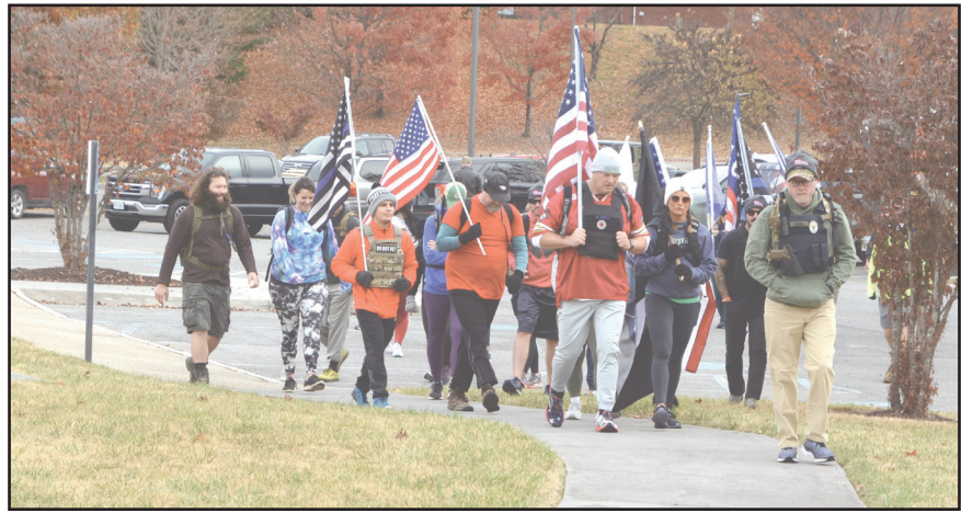
The Town of Vinton, the Vinton Police Department, and Queen City Rucking 22 held their first annual Ruck March on Nov. 11 in observance of Veterans Day 2023.