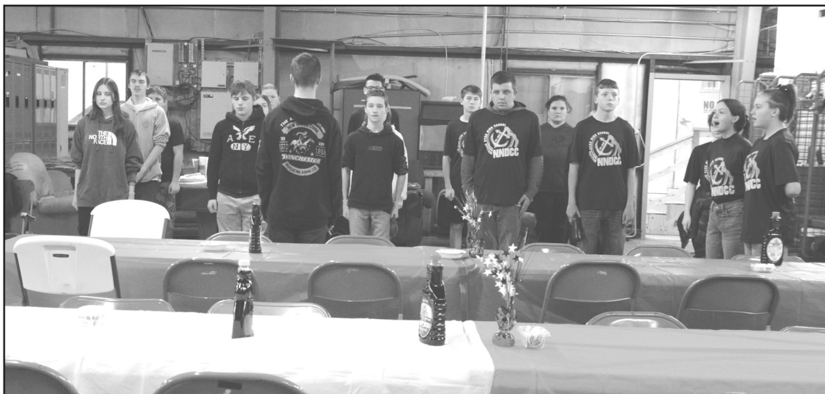
Cadets from the William Byrd High School Navy National Defense Cadet Corps assisted with the Veterans Day Breakfast and performed the national anthem.