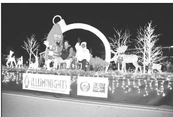
Roanoke County Parks, Recreation, and Tourism won first place in the non-religious category.