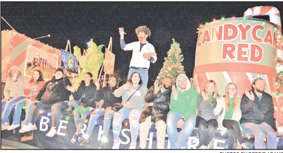
The Berkshire Health and Rehab float took second place in the non-religious category, featuring artist Bob Ross.