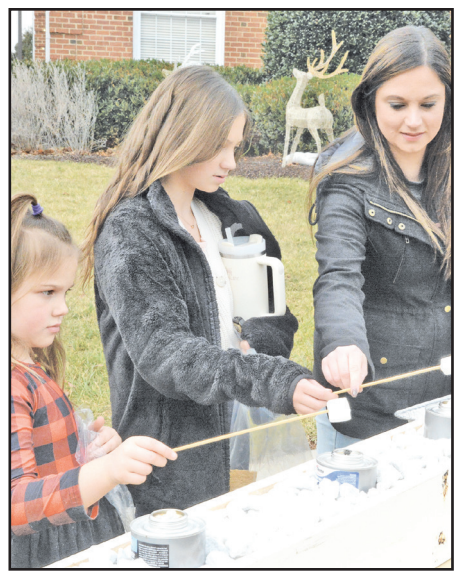
In addition to presenting a Christmas wish list to Santa, children are invited to make their own s'mores.