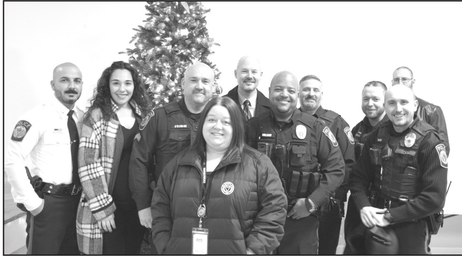
Several members of the Vinton Police Department made their annual visit to Santa at the Moose Lodge breakfast.