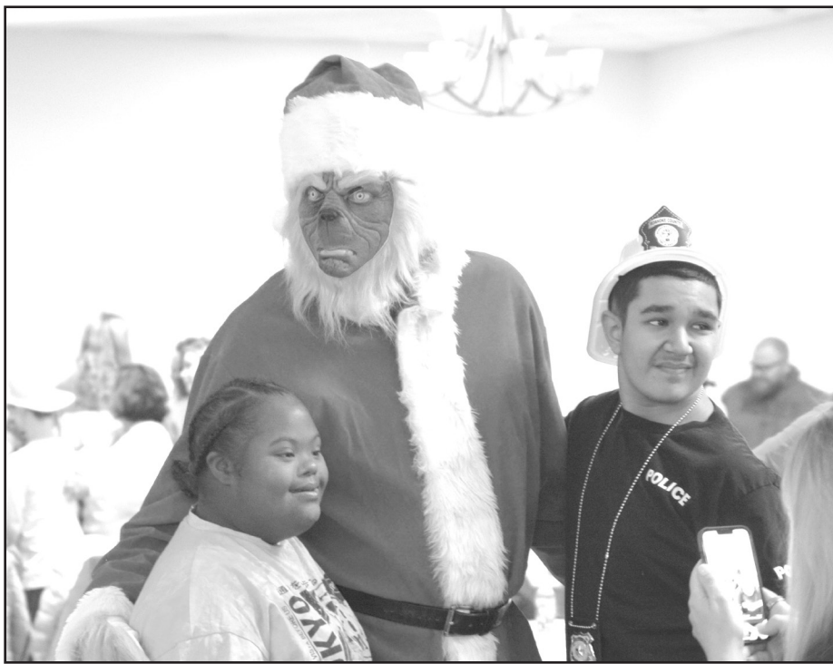
Students were not only anxious to visit with Santa but delighted to see the Grinch at the Santa Breakfast.

Breakfast with Santa is just one of the many community service events the Moose Lodge sponsors each year. Organized initially as a social club in the late 1800s, Moose International reorganized early in the 20th century with one of their main goals being caring for children and families in need across North America.