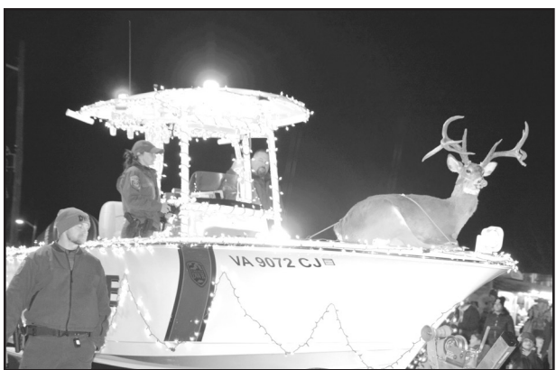
The Dept. of Wildlife Resources Conservation Police won third place in the non-religious category.