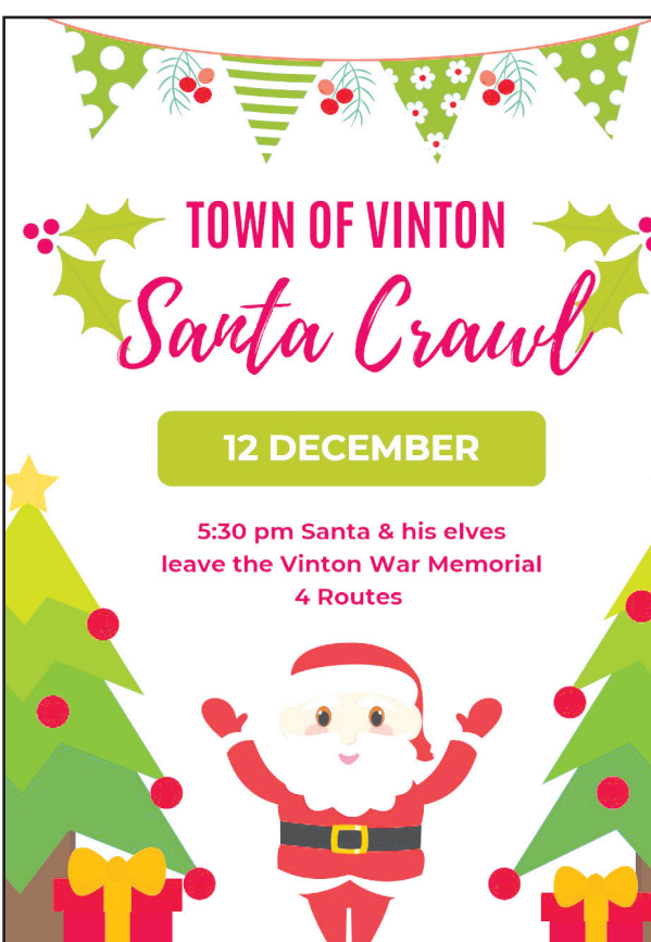
The annual Santa Crawl will return for its fourth year on Tuesday, December 12.

This year's event will start at 5:30 p.m. at the Vinton War Memorial, as Santa departs on his sleigh with help from the Vinton Police and Public Works Departments. The Santa sleigh will make its way through the town on four distinct routes. (Check The Vinton Messenger, InVinton, Town of Vinton, and Vinton Area Chamber of Commerce Facebook pages later