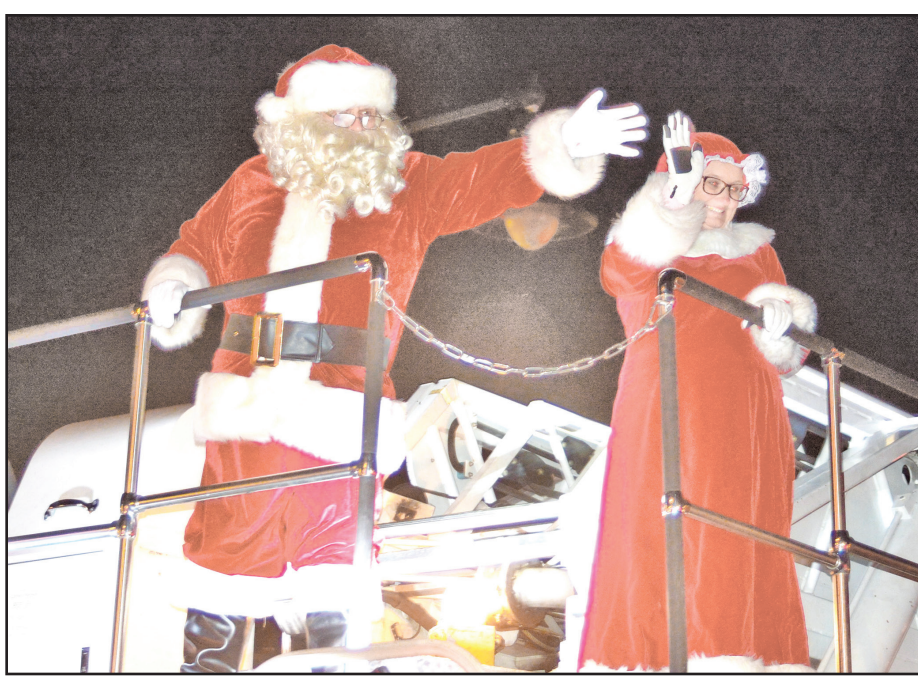
Santa and Mrs. Claus delighted the crowds from the top of a fire engine.