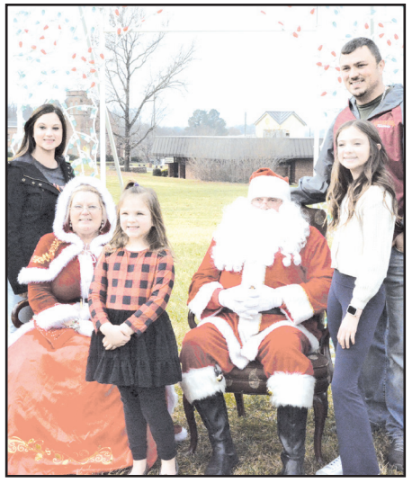
Santa, Mrs. Claus, and their elf visit with a family at the Vinton Parade of Trees at the Vinton War Memorial. Santa will return on December 10 and 20.