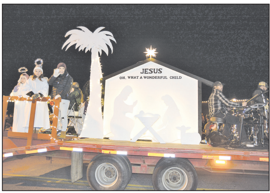
Jordantown Wesleyan Church won first place in the religious category, displaying the reason for the season.

Thursday, December 7, 2023 · Dogwood Capital of Virginia · Covering Vinton, Bonsack & Stewartsville (USPS-660-020) OurValley.org · $1.00