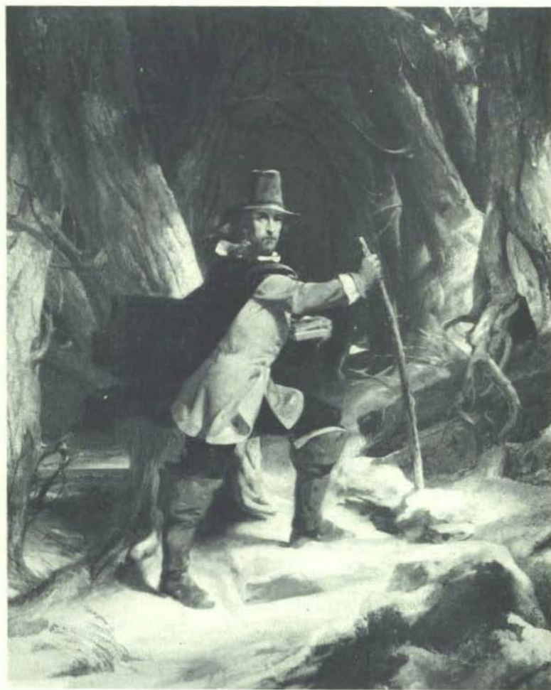
THE BANISHMENT OF ROGER WILLIAMS