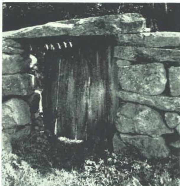
FOSTER TOWN POUND The original gate, of unusual pattern

CRANSTON TOWN POUNDS —None now existing. One of the Town Pounds was located at the corners of Wilbur Avenue and Phenix Avenue, west of the village of Oaklawn. Nothing remains of it at this time.