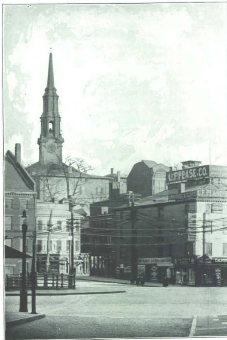
Halftone in R.I.H.S.