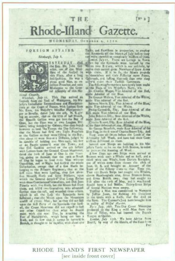
RHODE ISLAND'S FIRST NEWSPAPER [see inside front cover]