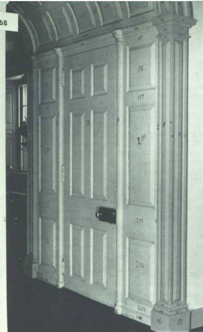
FIG. 1. The 1901 Marsden Perry corridor, between the southwest and northwest bedroom, numbered prior to removal and discovery of original side hall.