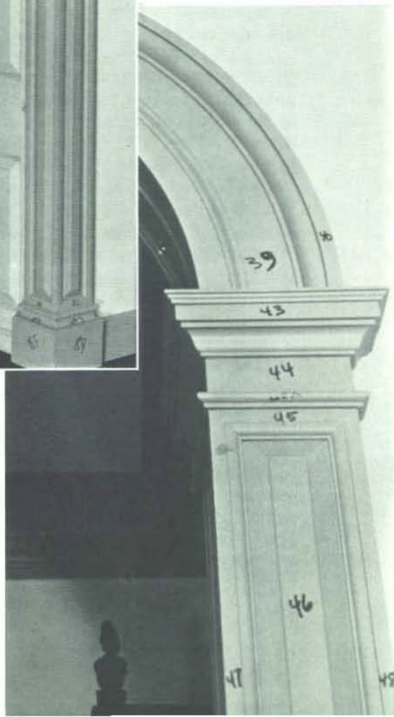
FIG. 2. Detail of numbered woodwork prior to investigation.