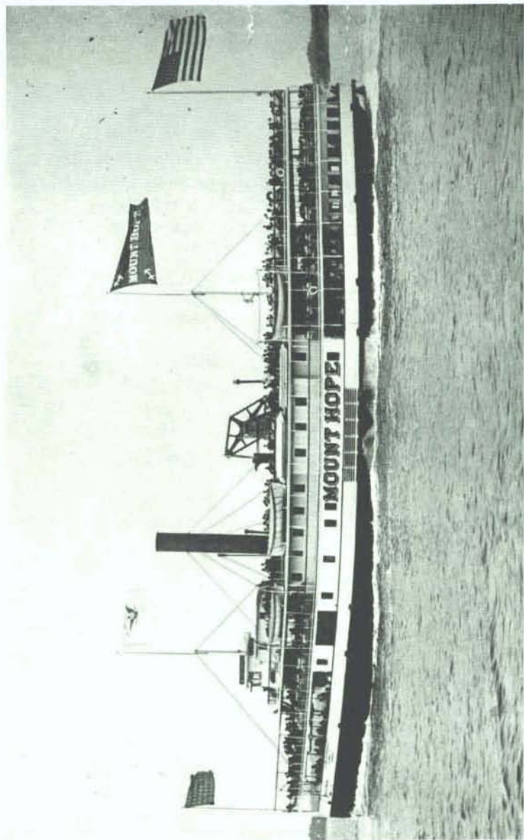
S.S. MOUNT HOPE

Photograph taken in the Providence River in the 1890's.