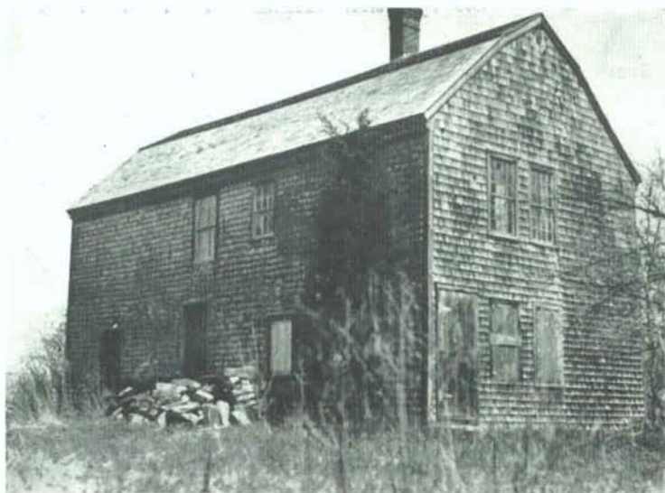
THE GLEBE AT NARRAGANSETT