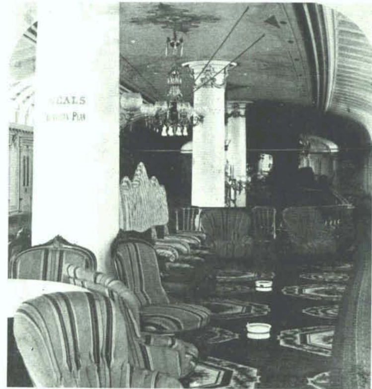
S. S. BRISTOL: THE GRAND SALOON

gas chandeliers with their crystal pendants, the "frescoed" ceiling, in elaborate patterns in color, and last but not least the conspicuous series of cuspidors—all in harmony with the most luxurious of hotels and private homes ashore. This was distinctly in contrast to the furnishings of the