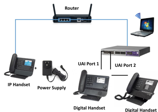
Set up - Option 2