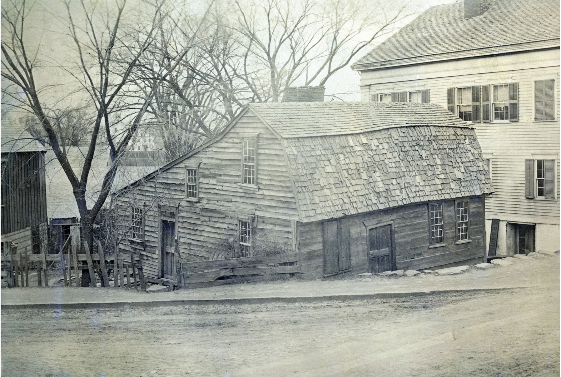
[William Caesar's House], c.1880, RHiX17158

The following document is a photograph of a house taken in 1880.