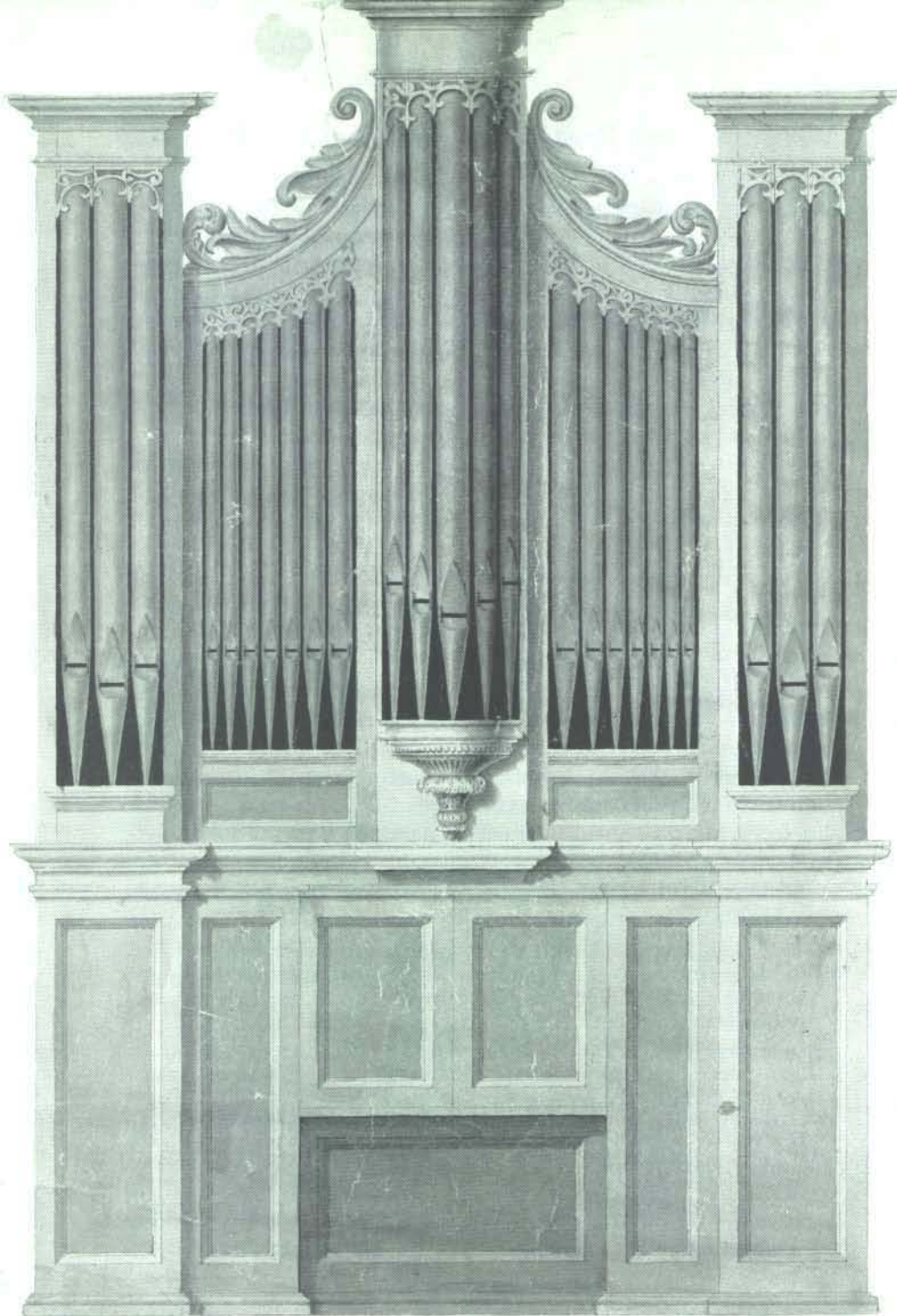
FIRST ORGAN INSTALLED IN BALCONY OF BENEFICENT CHURCH, JUNE 25, 1825