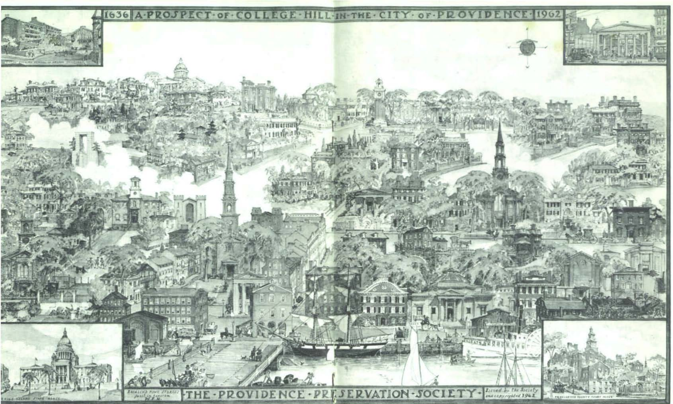
A PROSPECT OF COLLEGE HILL IN THE CITY OF PROVIDENCE

In 1962 the Providence Preservation Society published in full color the Prospect pictured above in black and white. This attractive panorama of the old East Side buildings was drawn and colored by Rosalind Howe Sturges. The overall size is approximately 31" by 21" and comes without