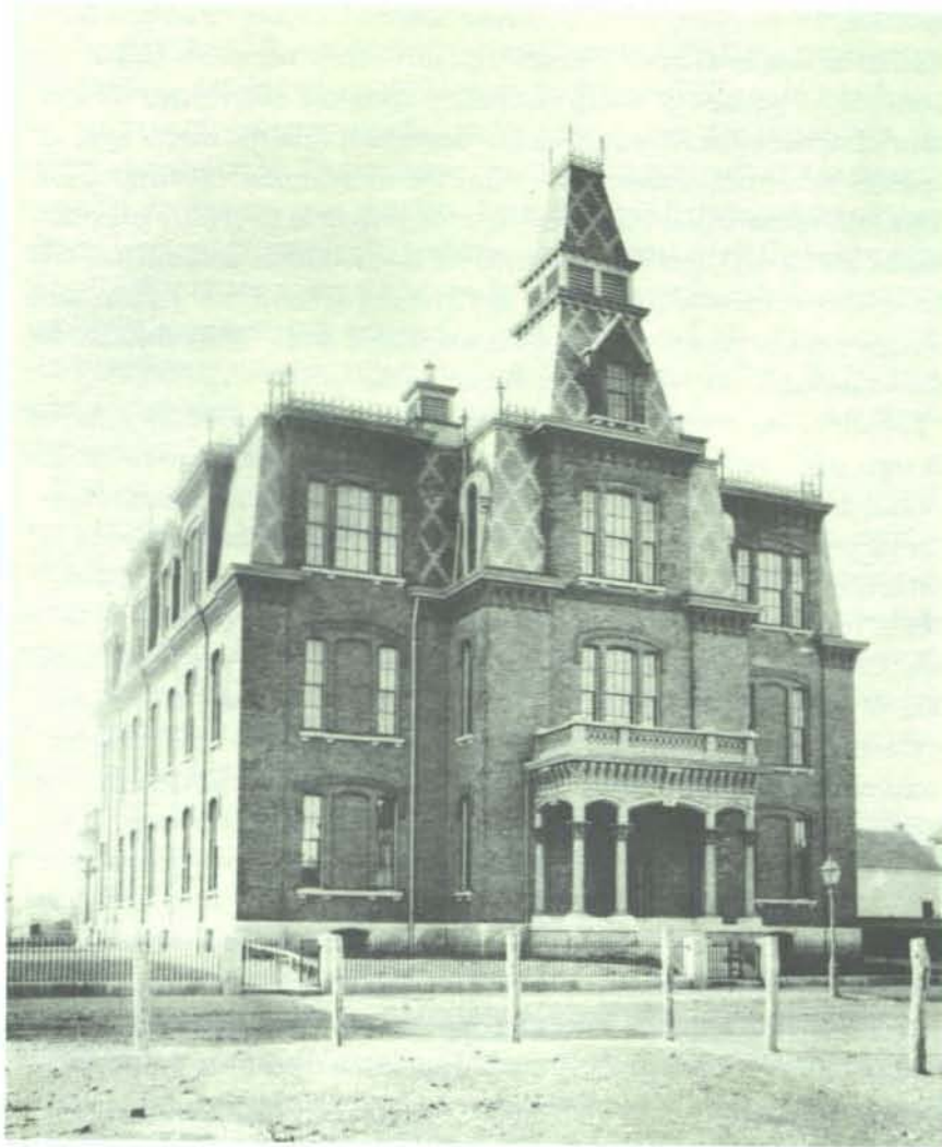
The Oxford Street Grammar School in 1886. From Providence Illustrated (1886), plate 75. Courtesy of Rhode Island Historical Society Library (RHi ×3 5092).

There were two areas, however, over which the school committee made recommendations but did not exercise control, the school budget and construction of new buildings. The city council annually determined the amount of money to be appropriated to the schools and, through its Department of Public Works, approved all construction. This situation provided constant frustration for the school committee, which found the city council forever ignoring its recommendations for a larger school budget and construction of new schoolhouses and administrative offices.