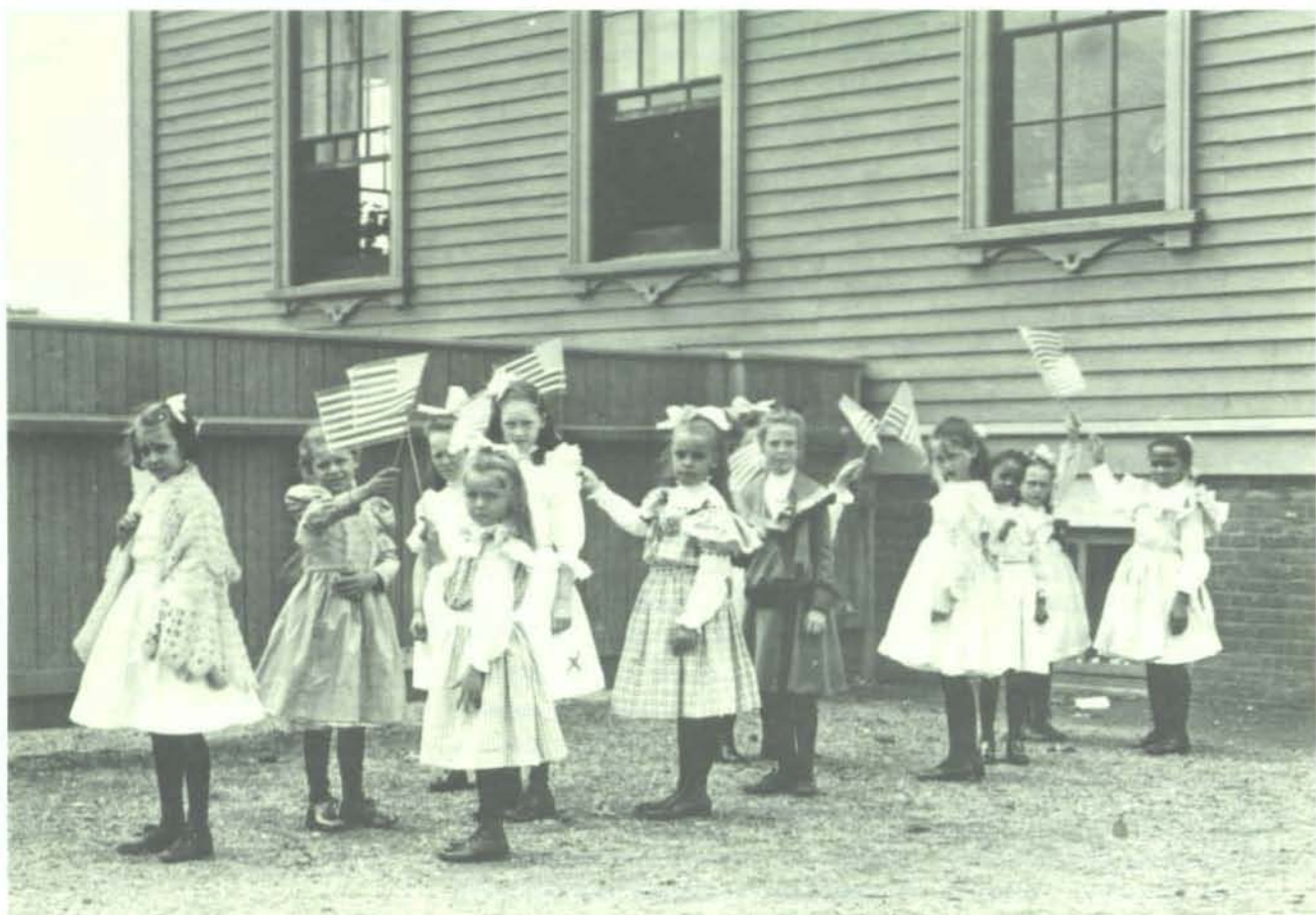
Pupils of the Slater Avenue School circa 1905. Photo by Frank Warren Marshall. Courtesy of Rhode Island Historical Society Library (RHi × 3 1165).